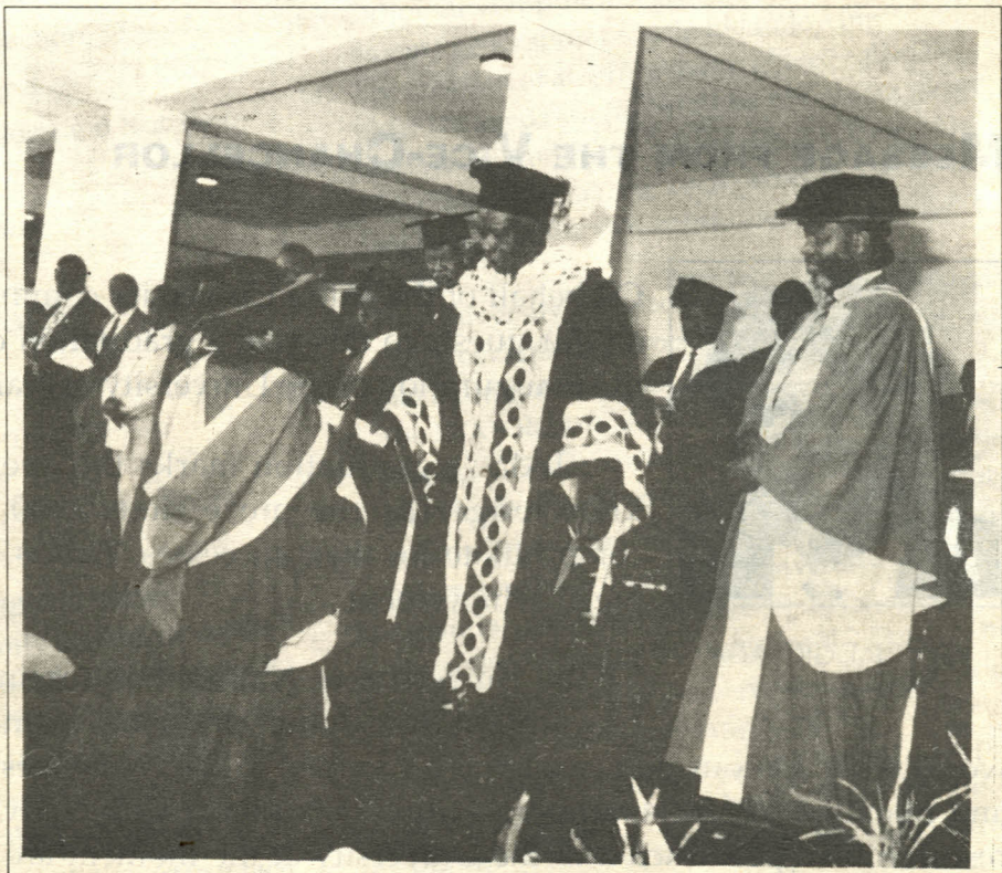
The Chancellor of the University of Nairobi His Excellency, President Daniel arap Moi conferring power to read (File picture)

The University of Nairobi has rendered its account to the nation and spelt out clearly what it has done for Kenya. The University has lived up to its mission and to the expectations and aspirations of the people of Kenya. It can now justify objectively and conclusively the vast amount of human, financial and material resources that have been invested over the years in its upkeep. In this regard, it is only fair to let the facts and figures speak for themselves.