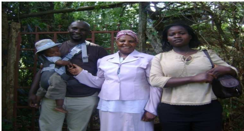
Plate 1: Elderly woman visited by family members

The elderly women preferred physical contact with their children and grandchildren. Ocharo (2009) also observed that the emerging trend in Kenya in so far as the interaction between the old and the young as young adult Kenyans are seen to be very busy to find quality time to interact with the aged parents and grandparents except during special occasions such as Christmas, funeral ceremonies and other social functions which makes it a must for the two groups to meet and interact.