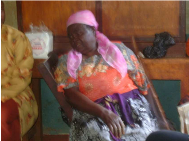
Plate 2: An elderly woman suffering from arthritis

she was glad that her sons met her medical bills, she was isolated from social relationships since she could no longer walk to church or attend social functions.