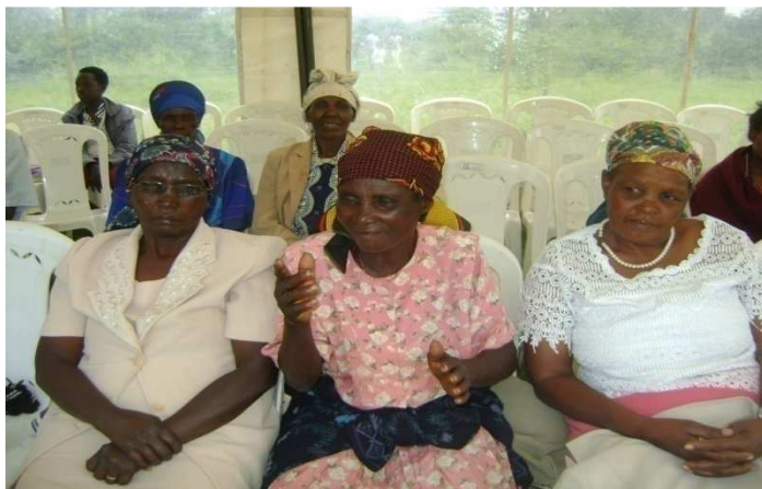
Plate 4: Elderly women engaged in a social event

The reluctance to join social groups can be explained by selective theory ( Laura Carstense,1991). The theory focuses on how changes in social contacts function in adult life. According to this theory, Social interaction has three functions: it is a source of information; it helps develop and maintain a sense of the self, and is a source of pleasure or emotional wellbeing. The first two – information and identity diminish since they are needed less as time goes on but the emotional function which depends on the quality of social support becomes central. The elderly women were more in need of emotional support than information and identity. The social groups offered information on savings and urged its members to seek financial empowerment more than offer emotional support. This proved to be a hindrance to the elderly women who had meager income to save in these groups.