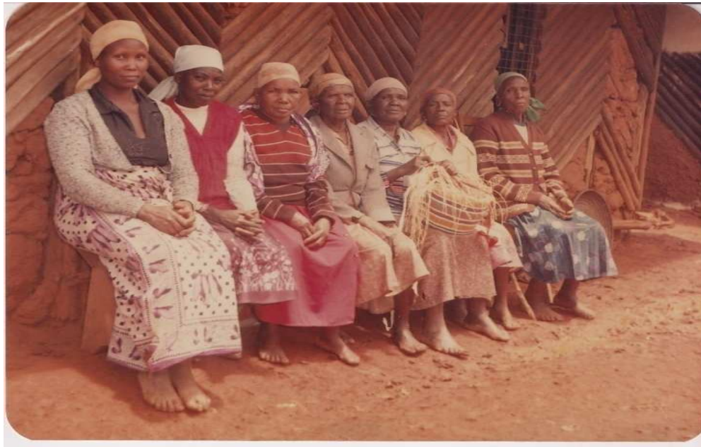
Plate 3: Elderly women attending a home based church group

key informants, a church clergy confirmed that some churches provided some form of material and moral support to the elderly. In some cases, the church members would repair leaking roofs and provide food ratios to elderly women who had minimal support from their off springs.