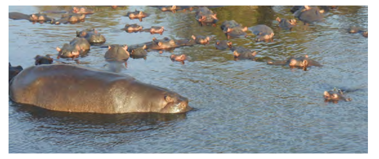
A picture of hippopotamus at Mara River

The eight beneficiaries will be expected to write a reportand present it for assessment by the Centre management team.