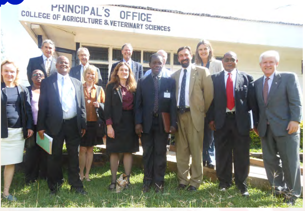
High profile delegation from CSU. The delegation signed an MOU with UoN and paid a courtesy call to the Principal, CAVS.

and Kenya northern drylands ( Isiolo, Samburu).