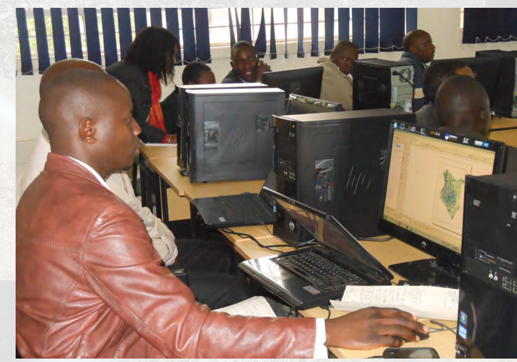
A section of PhD students undertake the GIS training at CAVS.

The GIS lab was set up in June 2012 at CAVS by CSDES in line with the Centre's second objective that seeks to develop a dryland leadership learning program at the UoN that will result to greater capacity of students and faculty to address the problems of dryland ecosystems and societies.