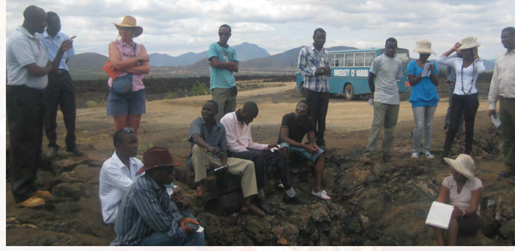
UoN students and beneficiaries of the field courses in one of the field training at Kibwezi

As we look to the future with a lot of optimism, it is my fervent hope that that in partnership with other stakeholders, the Centre will continue to transform Higher education and create relevant action research that builds human and institutional capacity for sustaining and improving the ecosystems and human livelihoods in the drylands of Kenya and beyond.