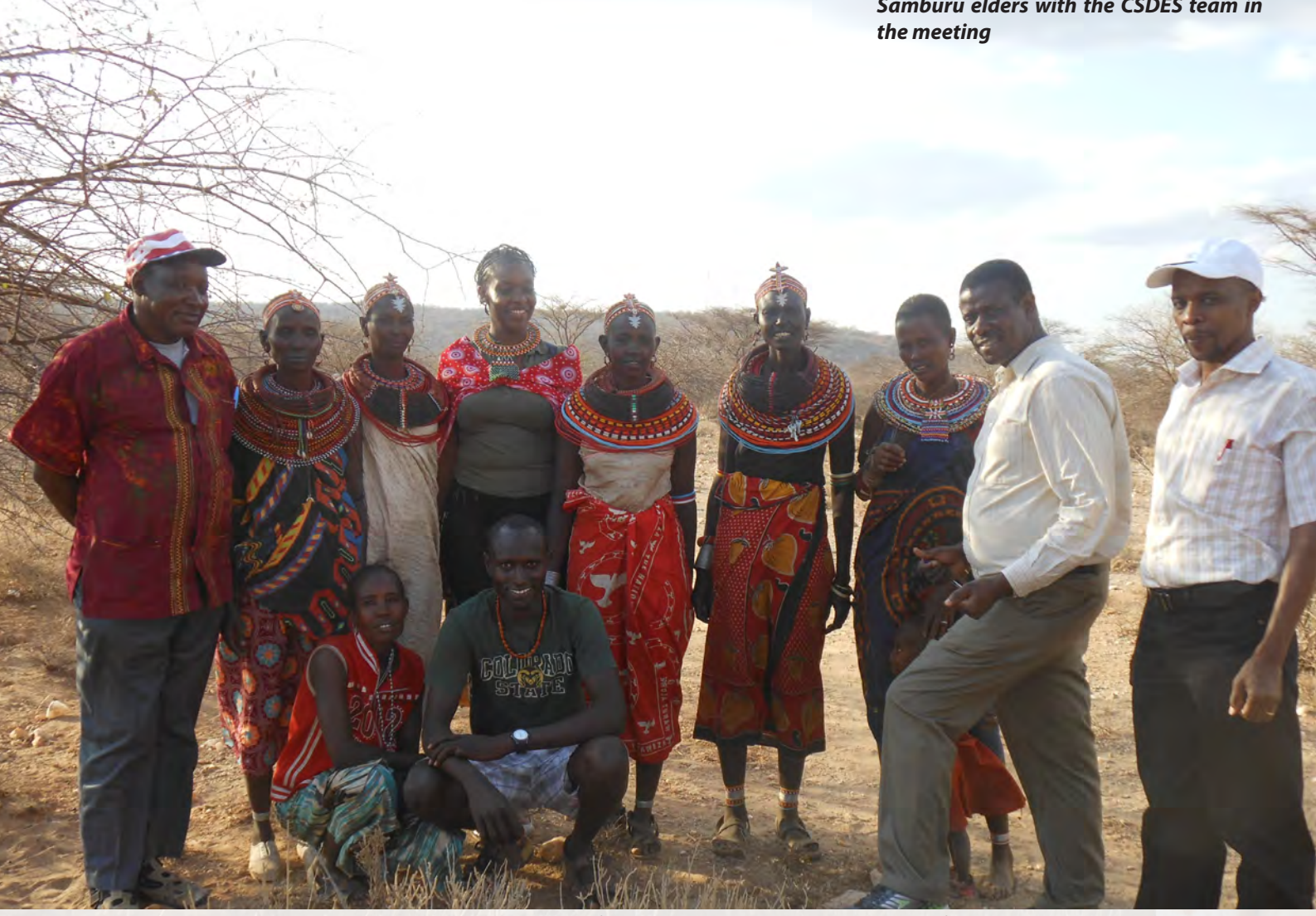
CSDES team pose for a photo with Sambutu women after a meeting