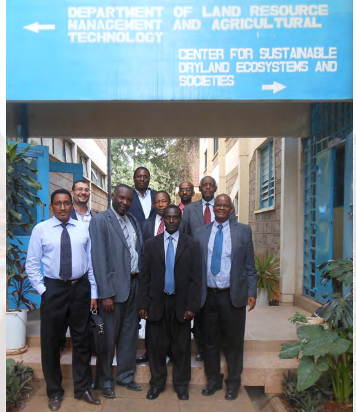
IGAD and CSDES teams pose for a photo after the meeting

he University of Nairobi (UoN) through the Centre for Sustainable Dryland Ecosystems and Societies (CSDES) and the Intergovernmental Authority on Development (IGAD) will continue to collaborate so as to strengthen community resilience in the drylands.