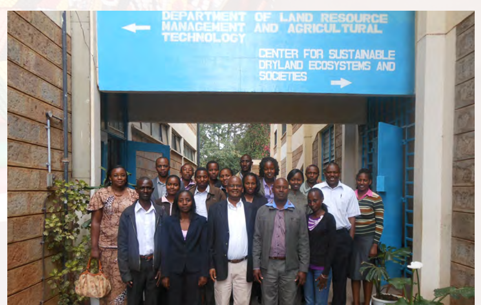
Beneficiaries of the internship program pose for a photo with the CSDES director after a mentorship meeting at UoN.

The partnership funded 15 interns from various dryland communities, some who were attached to the graduate students for mentoring. In September 2012, the CSDES, CSU and ODL experts from UoN College of Education and E- learning Center conducted a fact finding field assessment for the development of Dryland curricula. The tour covered the Kenya southern drylands (Kibwezi andTaitaTaveta – Tsavo)