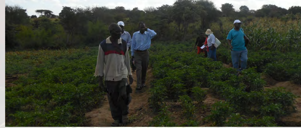
One of the farmers take the UoN delegation around his farm in Yatta

After the 2009 drought that hit the country, the households came together under a church-led project with the aim of kicking out hunger