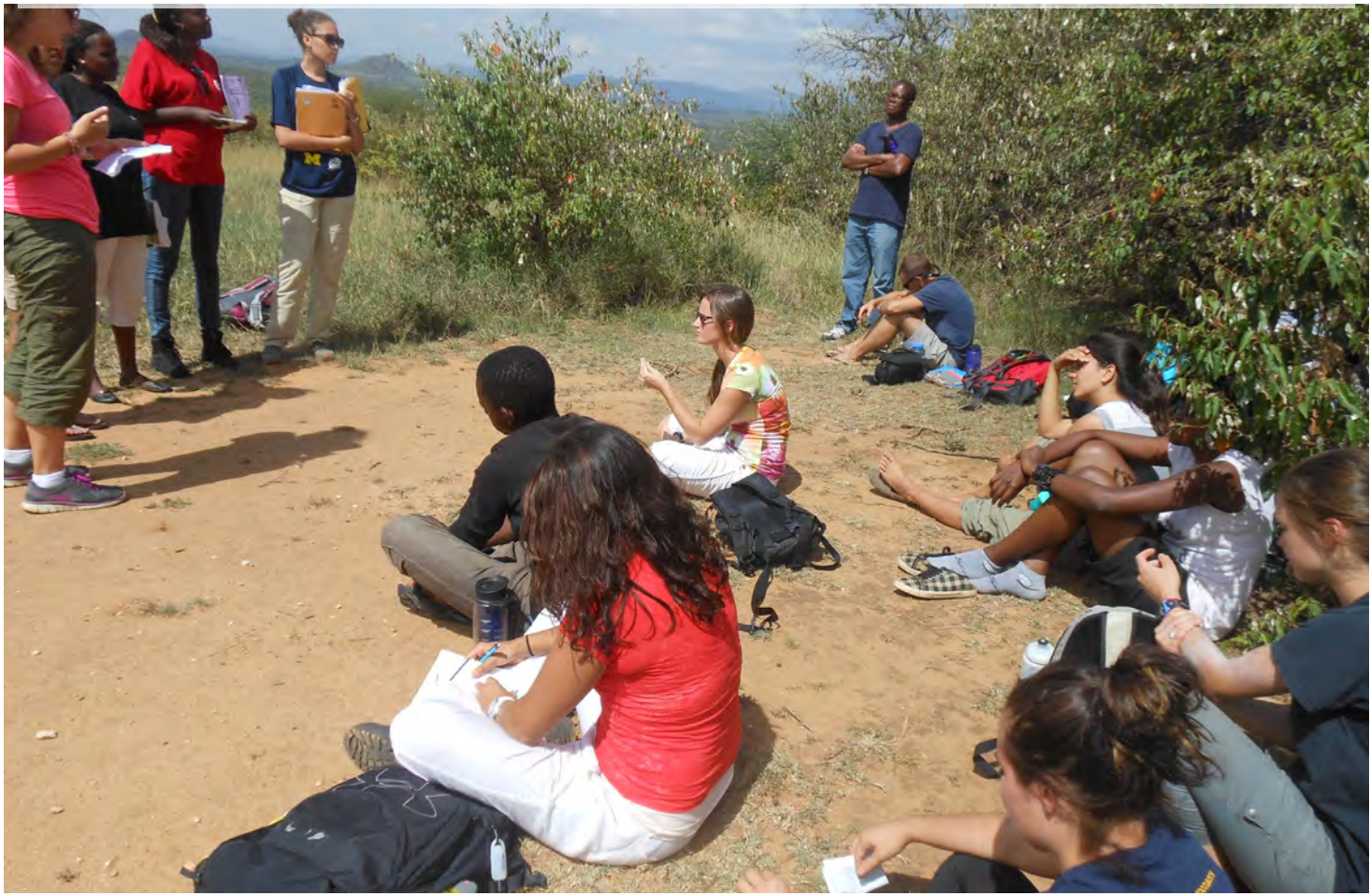
Students of UoN and UoM take notes during the field course at Maasai Mara

ight students from University of Nairobi (UoN) have benefitted from three weeks field study experience organized by the University of Nairobi'sCentre for Sustainable Dryland Ecosystems and Societies in collaboration with overseas Universities. This brings the total number of field course beneficiaries in the past two years to 38.