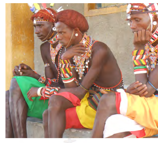
Samburu Morans follow discussions

The CSDES team met with several groups including community elders, women and the SamburuMoran's. The team also visited the University of Nairobi extramural Centre in Isiolo town in a bid to forge CSDES plans for rolling out open and distance learning (ODL) and E-learning courses for Isiolo and adjacent communities.