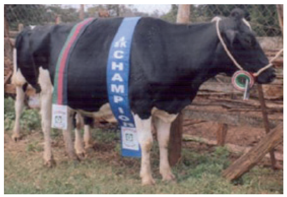
Champion Dairy Cow