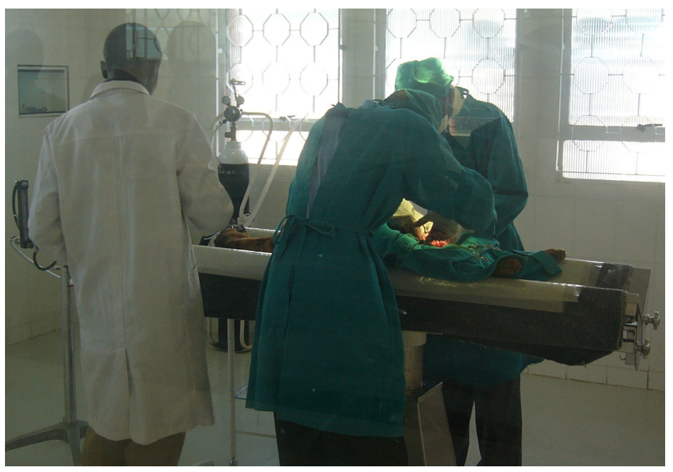
Students carrying out an operation during a practical class