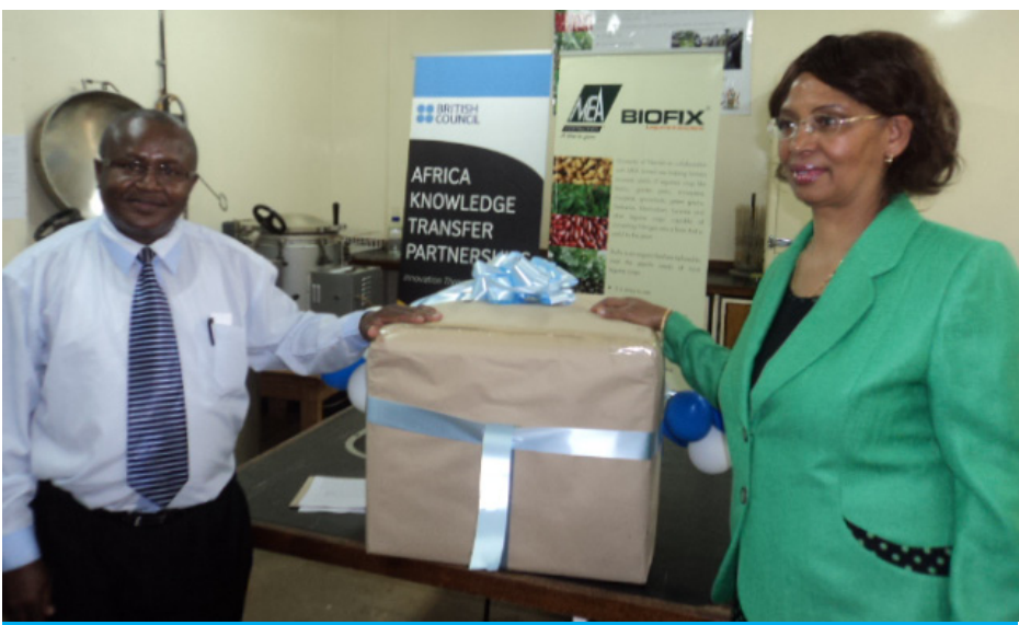
Principal CAVs receiving and Equipment to support the Africa Knowledge Transfer Partnership