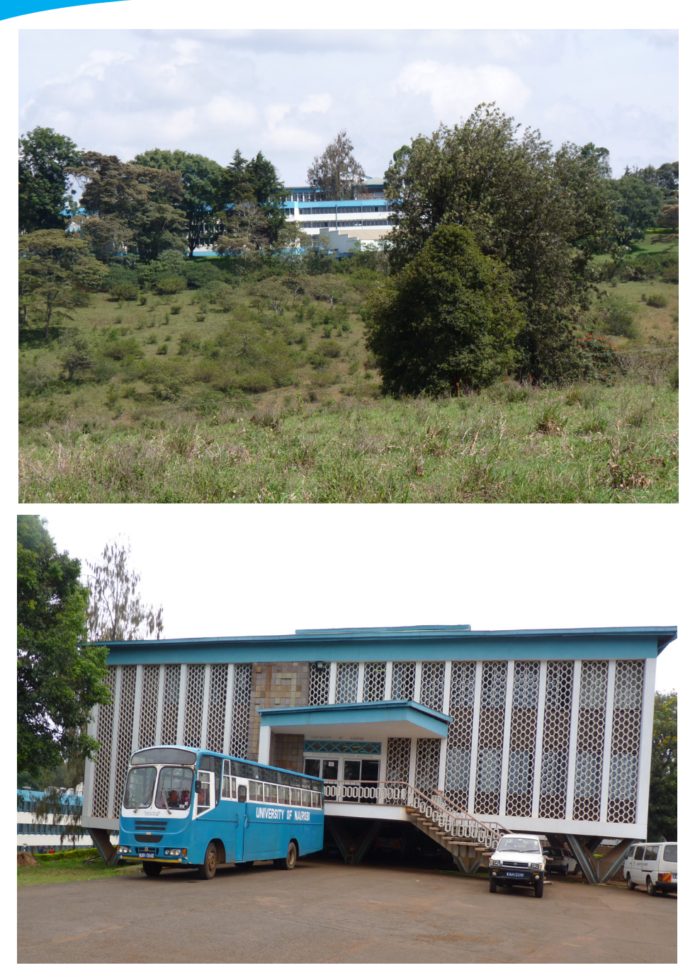
College Teaching Facilities