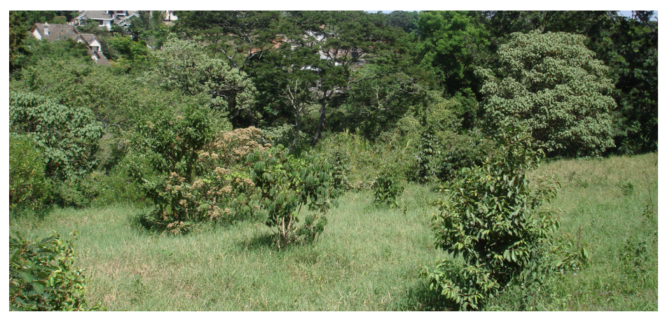
Botanical garden of medicinal plants at CAVS field station established under the project