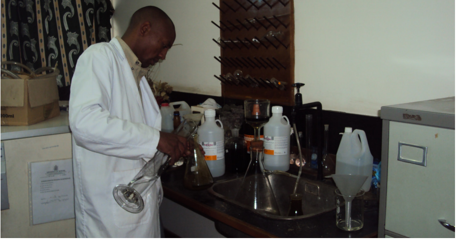
A PhD student cvarrying out a research project of natural products