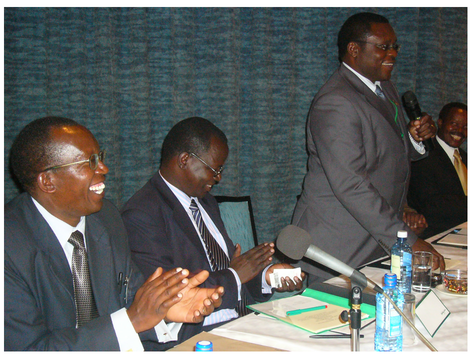
Dean, FVM and PS Ministry of Livestock in Leather Curriculum workshop