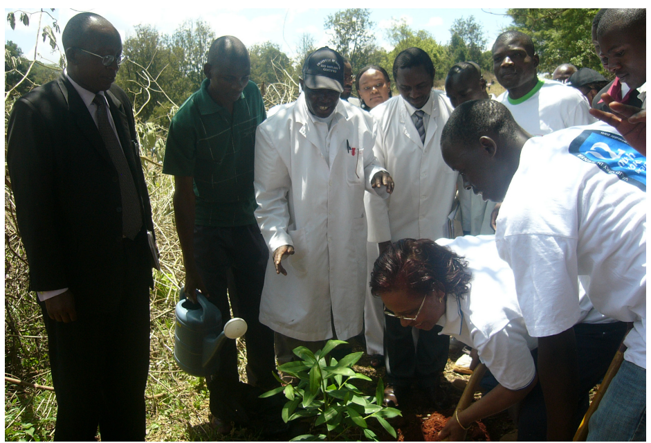
The Principal CAVS planting a tree during college tree planting day

Watchman II Milkman II Poultry Attendant II Labourer II