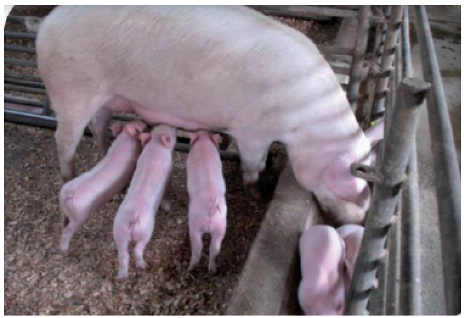
Pig Production in the Farm