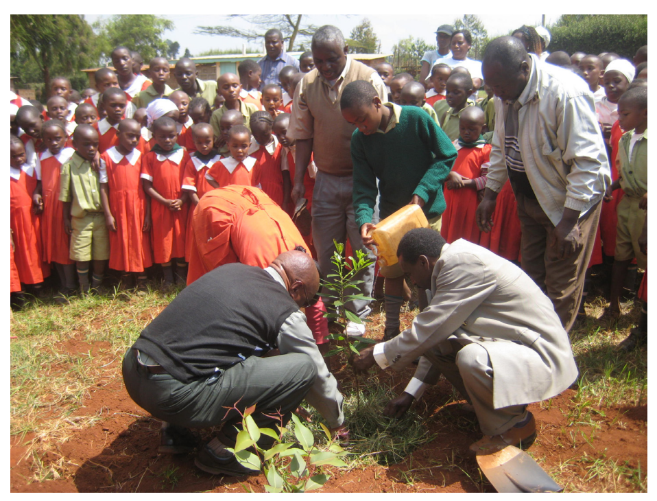
School Children being shown how to plant a tree by staff from the college