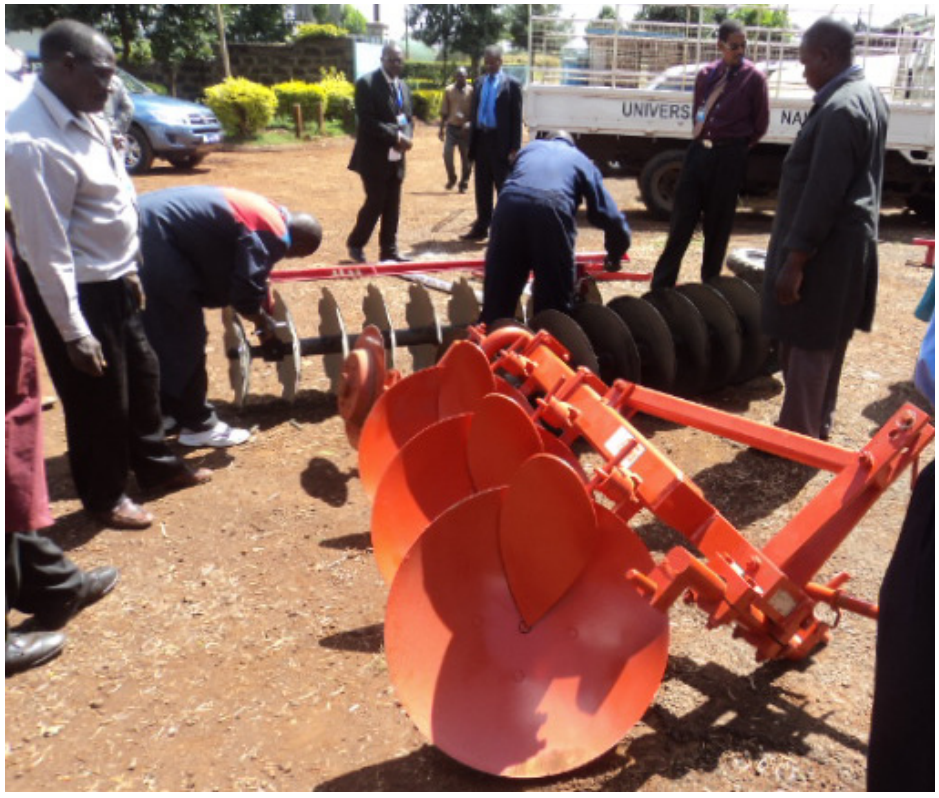
New farm implements are received at the Field Station procured through SEMIs project funded by AGRA