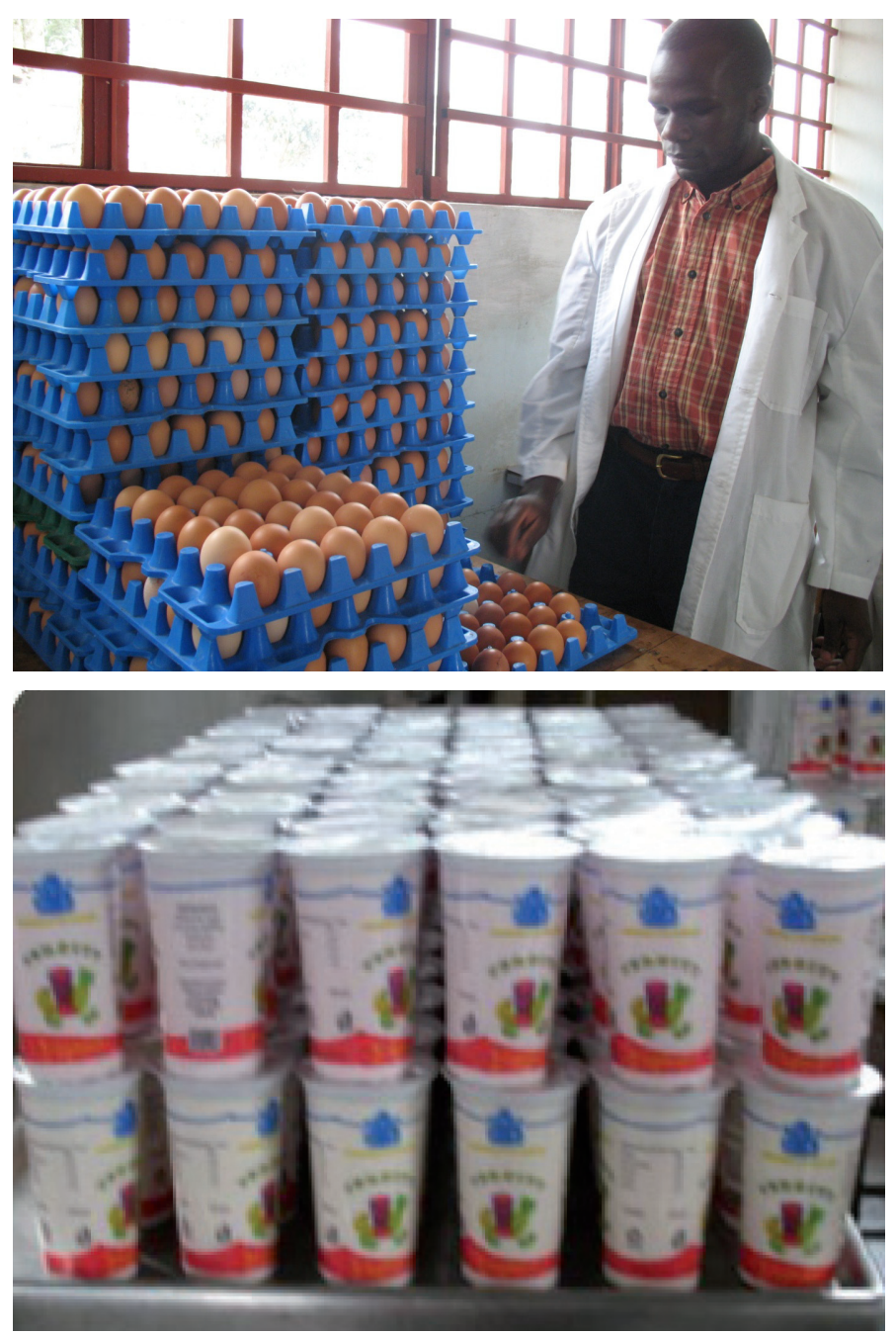
Eggs and Milk Products from college farm