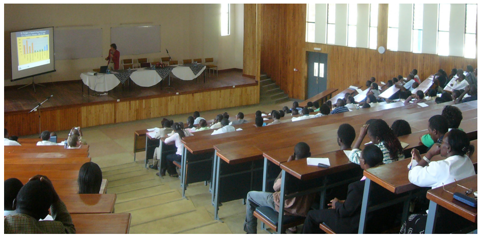
Public Lecture at the 8.4.4 Auditorium