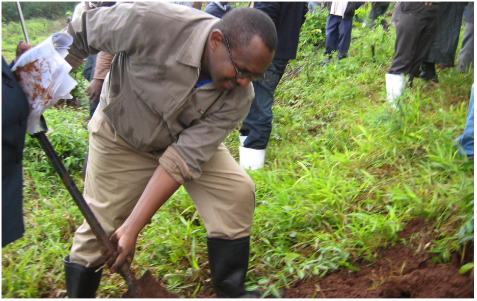
The Manager Veterinary Farm, Planting a tree