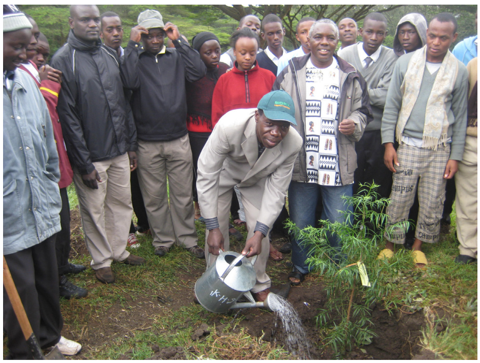
The Dean of Agriculture planting a tree