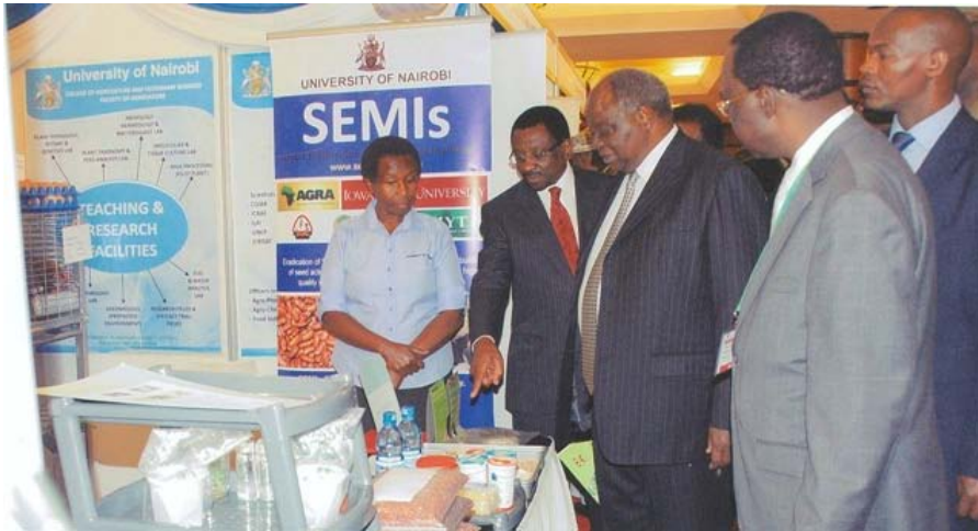
Agricultural Sector Development forum- Kibaki in attendance