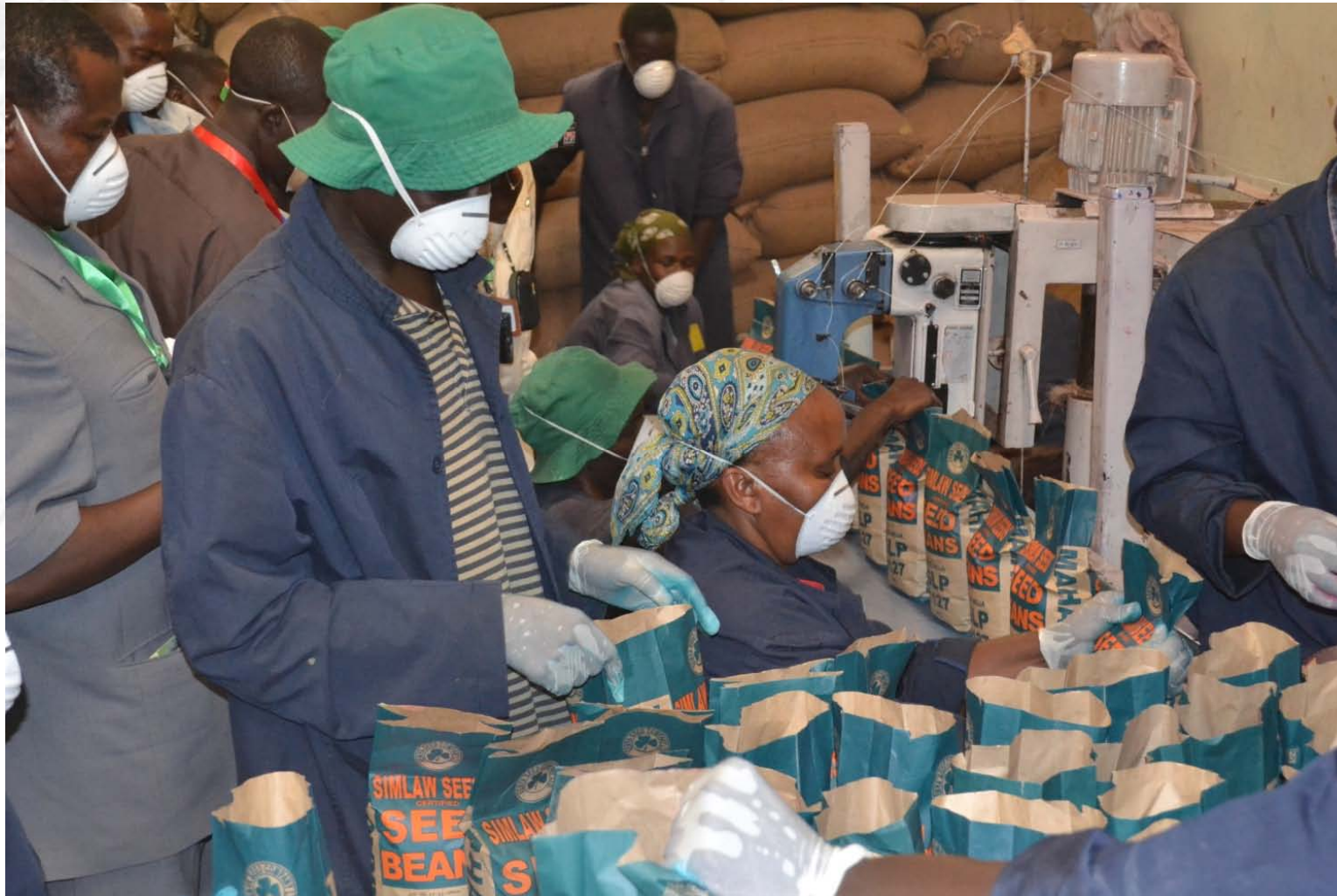
Familiarization with Certified seed packaging at a seed company in Kenya