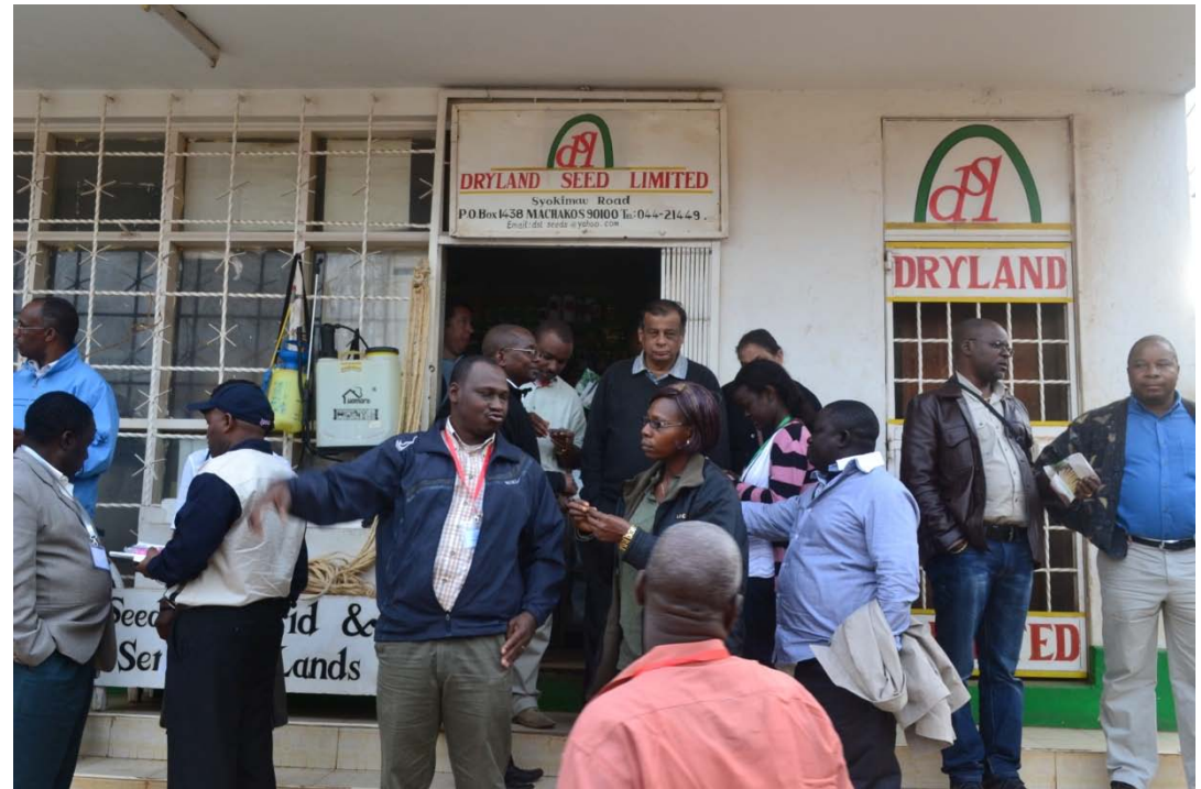
Dry Land Seed co.

The training at SEMIs is helping Scaling up production of high quality seed for farmers around Africa