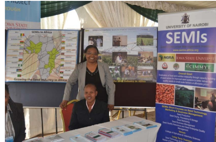
Kenya-Agricultural transformation Day in Nairobi