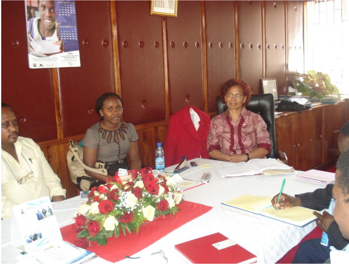
Seed company personnel with STAK officials call in at SEMI