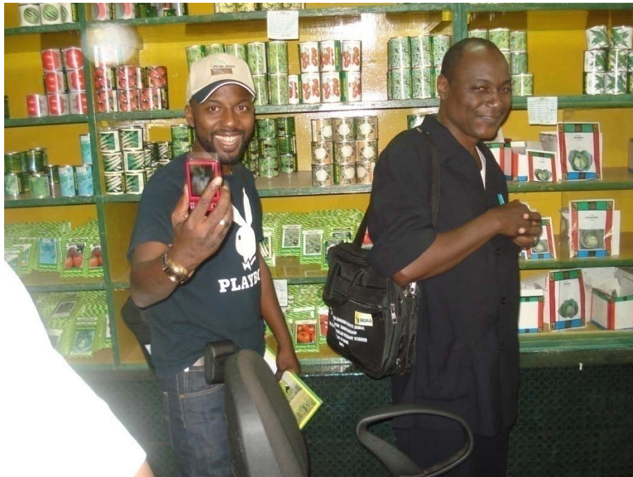
Visiting the seed industry- Visit to SIMLAW seeds