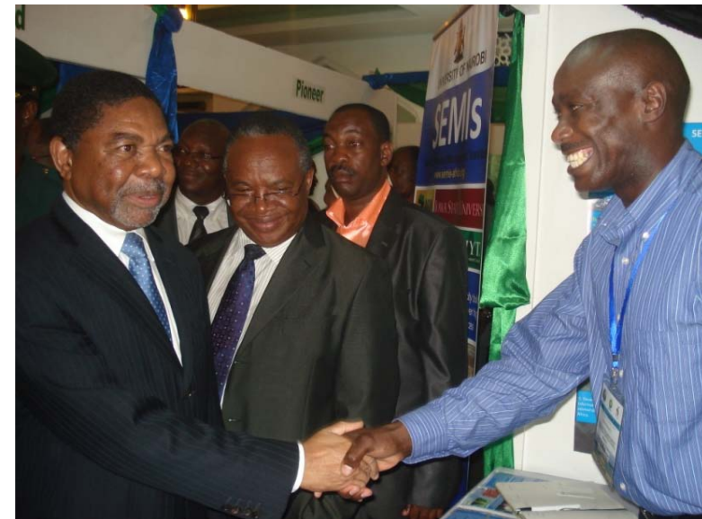
H.E. Mohamed Shein Pres. Of Zanzibar at the AFSTA-Congress Zanzibar