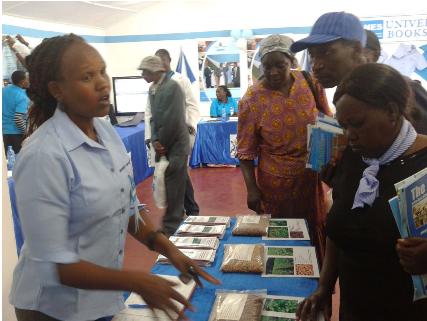
Rosebenna from SEMIs talks to farmers on the New Bean Varieties