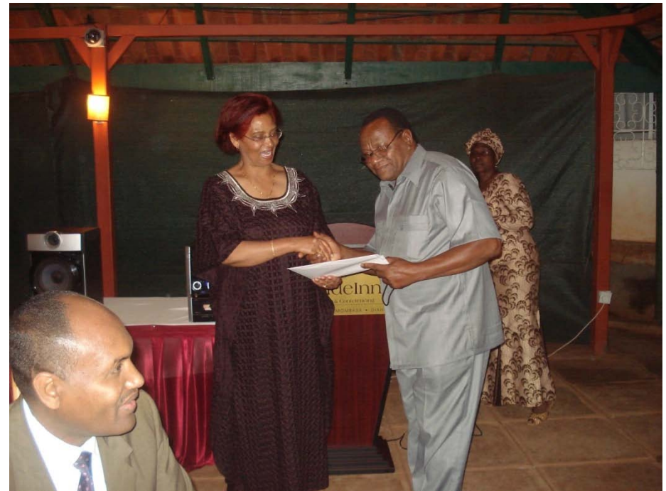
Certificate presentation on Graduation