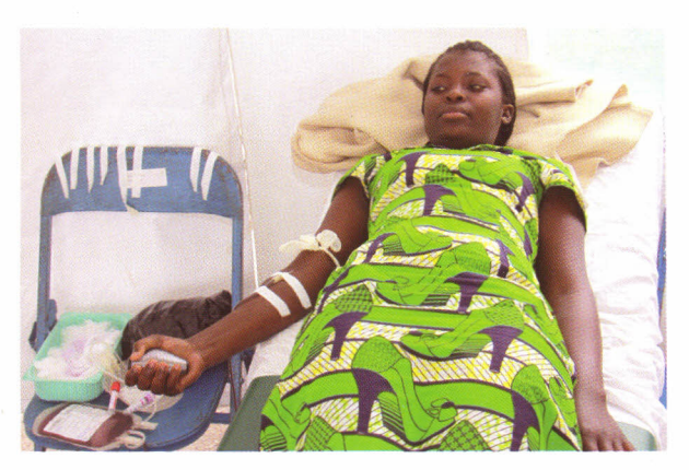
UoN students and staff donate blood during the drive.

he University of Nairobi (UoN) responded swiftly in supporting victims of the Westgate Shopping Mall terrorist attack on September 21, 2013 by setting up a blood donation drive. The blood drive was set up at the Chancellor's Court next to the University sports grounds and attracted many donors from the University community.