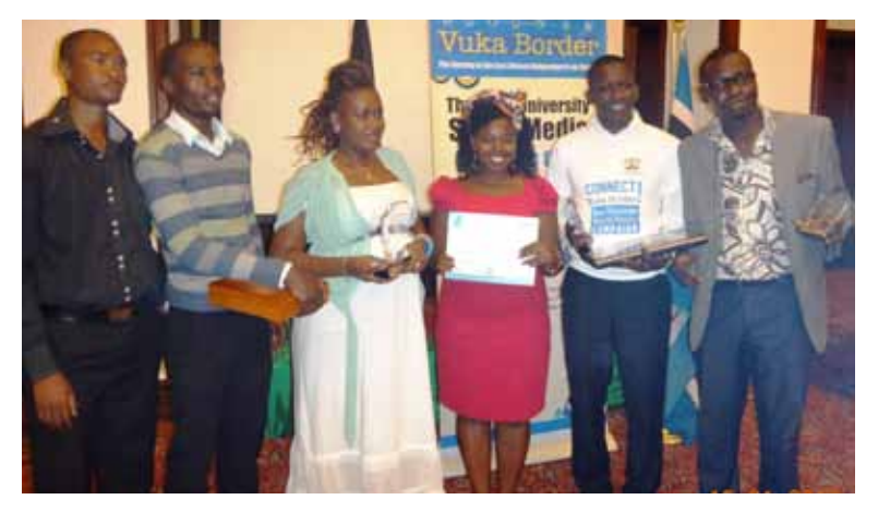
WOSWA & SONU at EAC Award Giving Ceremony

WOSWA also had the chance to accompany 'Mothers and Daughters' to Machakos Girls School on a mentorship programme. This gave us the opportunity to give back by sharing our experiences and what we have learnt from our mentors. It was beyond amazing to watch these young girls look at us with admiration and desire to be in our shoes. We encouraged them to work hard, and welcome them in advance to the University of Nairobi. This was a platform for us to perfect our public speaking and