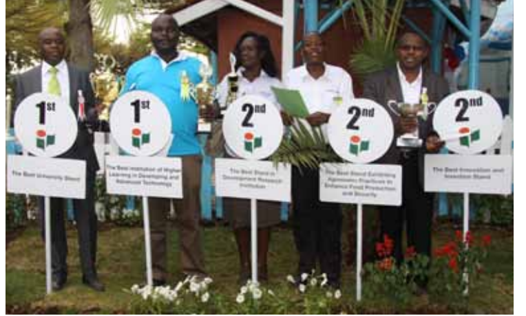
University of Nairobi students and members of stand show off the prizes.

Various departments from the University at the annual event which accords UoN a platform to share information with stakeholders among them potential students, parents and the general public on its programme and services, and its role in national development. On display at the University stands were research innovations, food crops and farm animals which were in line with this year's trade fair theme- 'Enhancing Technology in Agriculture and Industry for Food Security and National Growth.'