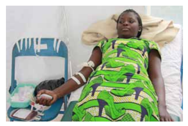
UoN students and staff donate blood during the drive.

The University of Nairobi (UoN) responded swiftly in supporting victims of the Westgate Shopping Mall terrorist attack on September 21, 2013 by setting up a blood donation drive. The blood drive was set up at the Chancellor's Court next to the University sports grounds and attracted many donors from the University community.