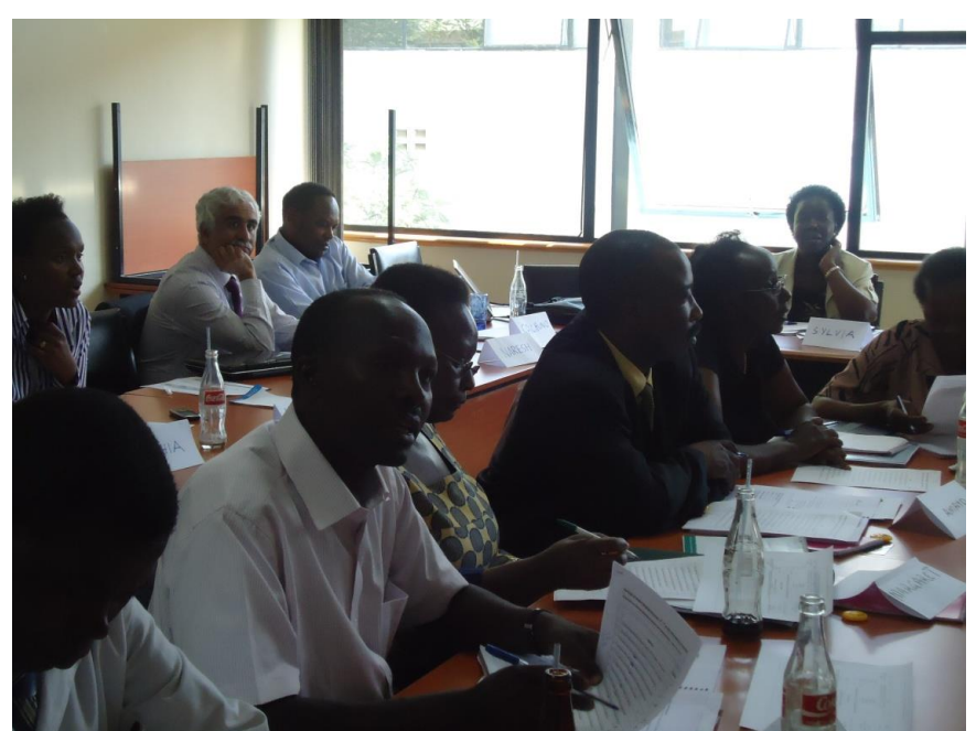
Fig 1: Participants in the Medical Education Course