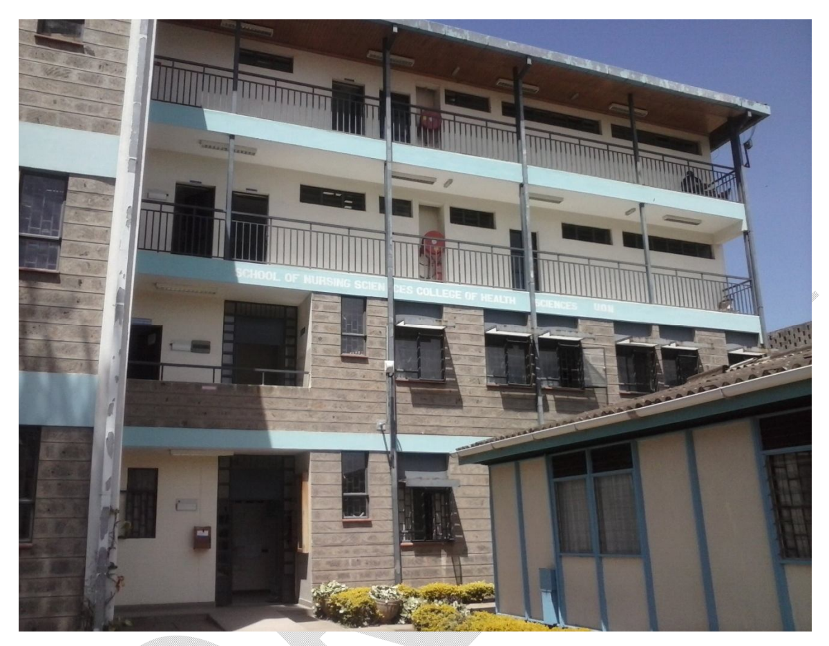
School of Nursing Sciences, College of health Sciences located at the Kenyatta National Hospital Campus