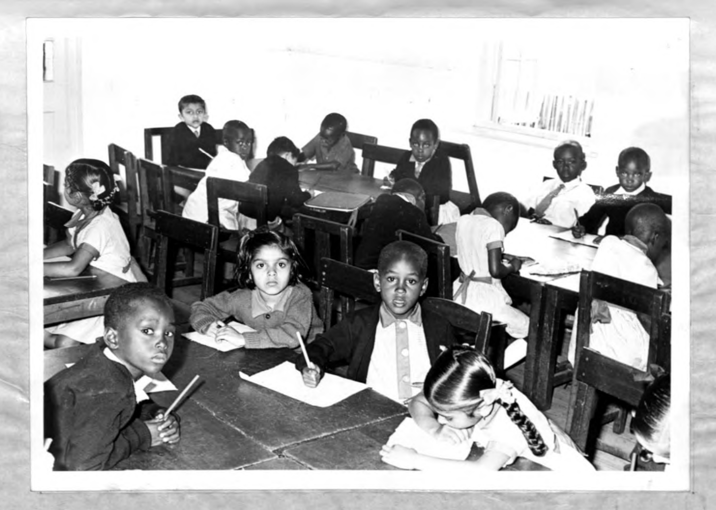
Plate 1. Educating for a multi-racial Kenyan Society: Schools are instruments of fostering national unity.