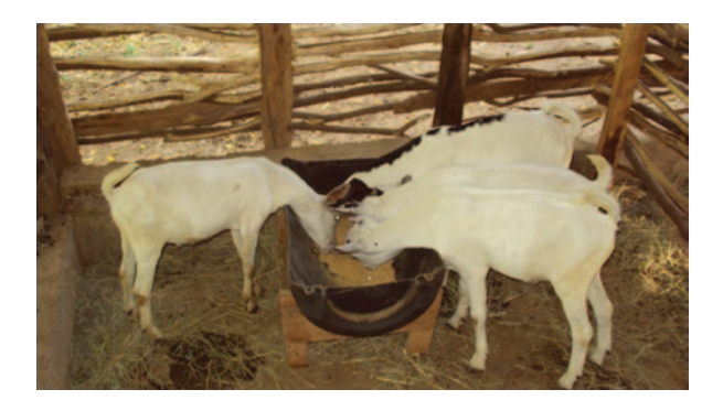
Fig. 13.1 Experimental weaner Galla goats feeding on Prosopis juliflora seed-pods meal

cool dry store. They were sun dried for three days for easy milling and storage for a longer period. The pods were ground in a 2–3 mm hammer mill to form seedpods meal.