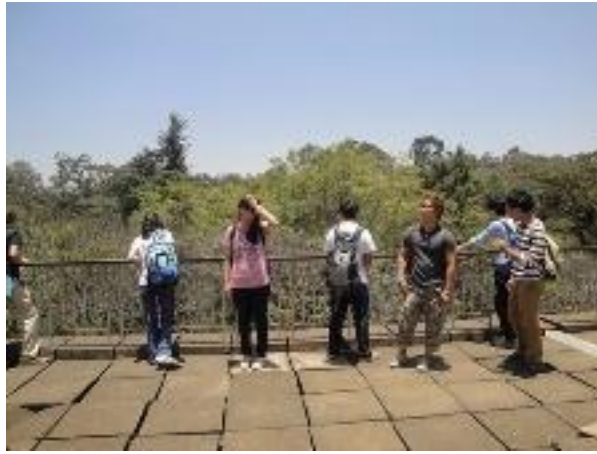
Photo: Students from Japan during their recent visit to Department of Meteorology