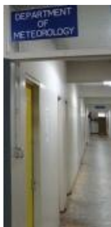
Dept. of Meteorology faculty offices

The Department is in possession of the following facilities used in teaching and research: An Urban air pollution monitoring station comprising of Surface Ozone and Carbon Monoxide Analyzers, Meteorological station and demonstration station among others.