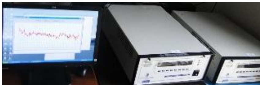
Surface Ozone and Carbon Monoxide Analyzers