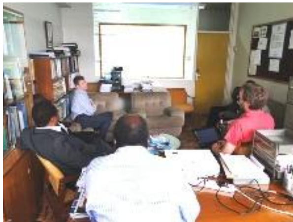
Photo: Officials from belgingur during a recent visit to the Department. Belgingur is a forecasting organization in Iceland.