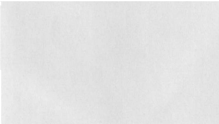
Figure I: Conceptual Framework showing Interrelationships between Key Variables of the Study