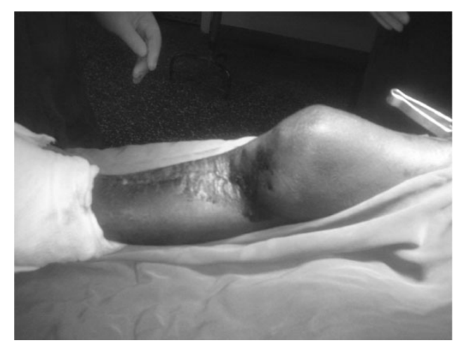
Clinical picture of limb after elimination of infection

A decision was then made to operate with surgical options available being: tibialization of the fibula, segment transport or a through-knee disarticulation. Tibialization of the fibula was the option chosen as it