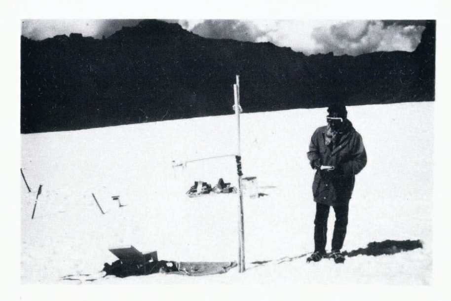
Fig. 2. Installation for measurement of radiation on a vertical surface.

device around a horizontal axis and levelling bubbles. Interchangeable glass and plastic (lupolén) cupolas yield measurements in the spectral regions of 0.3–4.0 \mu m and 0.3–30.0 \mu m respectively. Radiation in the long-wave region 4–30 \mu m is obtained by difference. A small thermometer inserted in the thermopile head permits an estimate of the temperature of the sensing surface and hence the calculation of the black-body radiation emitted from the sensor surface according to the Stefan–Boltzmann law. Thus the long-wave radiation impinging on the sensor surface can be determined. The thermopile is fitted with a white collar to eliminate short-wave reflection from the opposite hemisphere.