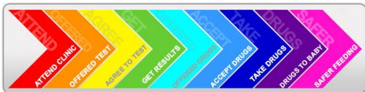
Table 1.1: PMTCT Progress

This diagram below shows the different stages that a woman must progress through to complete a PMTCT program.