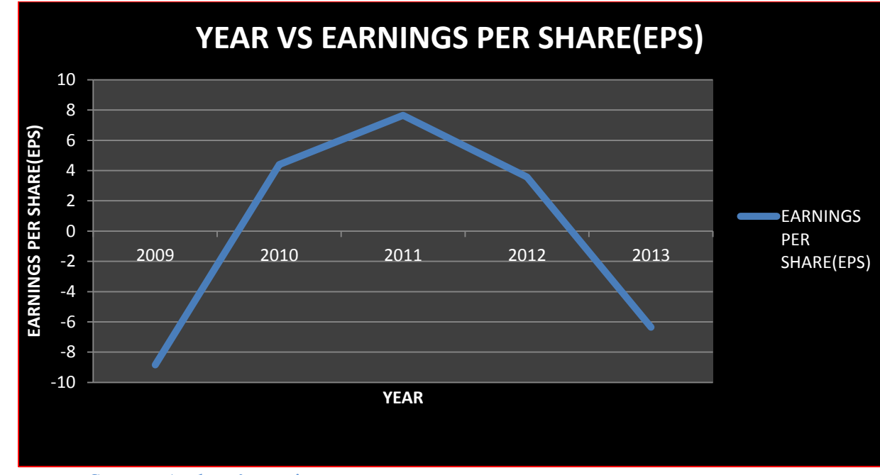
FIG 2

The drop in profitability witnessed from 2012 maybe due to negative economic and geopolitical environment, in addition, travel advisories issued by western countries after the 2013 terror attack led the poor performance.