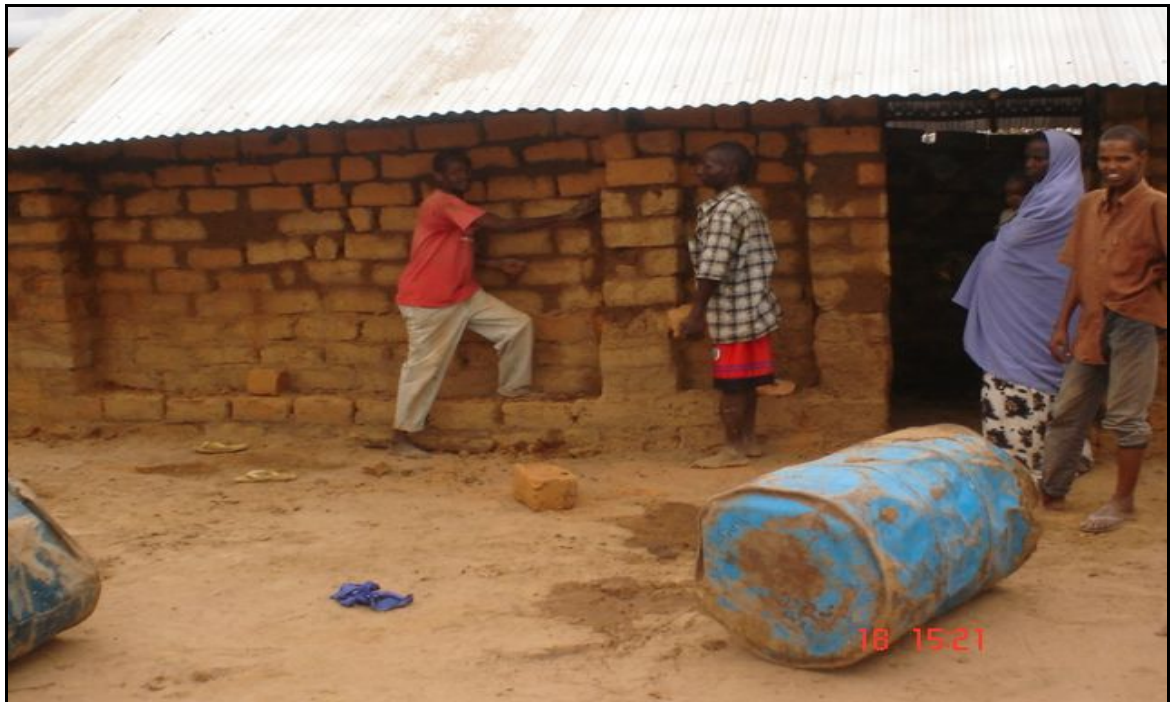
One shelter at walling and roofing stage with beneficiaries participating in the construction