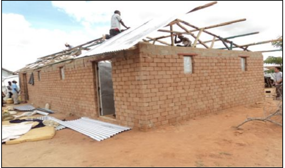
A prototype ISSB shelter