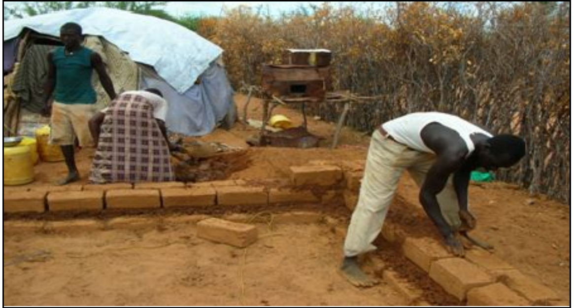
Laying of foundation of a mud brick house