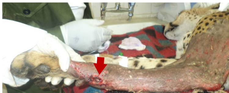
Figure 1 Injured left forelimb. Note the wound on the caudo-medial aspect of the antebrachium (arrow).