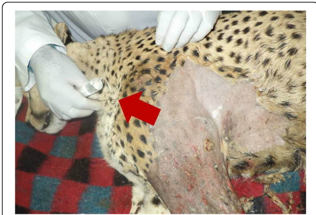
Figure 3 Brachial plexus nerve block. This was achieved through blind needle placement by introducing a hypodermic needle (arrow) through a point cranio-medial to the scapula-humeral joint and advanced in a caudo-dorsal direction.

orthopaedic procedure. Absence of autonomic cardiopulmonary reactions to the surgical manipulation may be attributed to the efficacy of brachial plexus block. Apart from lidocaine, other local anaesthetics can be used; bupivacaine has been shown to confer long term perioperative analgesia while ropivacaine provides superior analgesia with minimal motor effects [18] owing to the fact that it is less potent at blocking A \beta fibres, but more potent in blocking A \delta and C fibres [19].