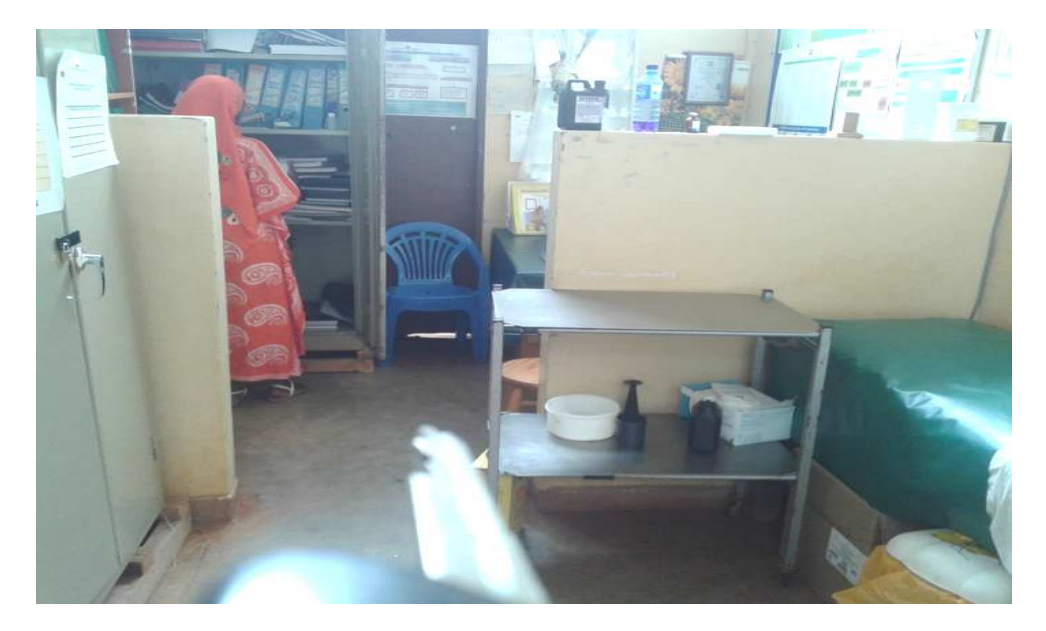
Figure 4.3: PMTCT consultation room at Murang'a District Hospital

Evidence from observation further shows the degree of congestion given that; the consultation room has one desk as a work station for all staff that includes at least one clinical officer, one nurse and two volunteer mentor mothers (peer educators). This inadequacy of ample space could be a reason that discourages the HCW to invite men inside the consultation room.