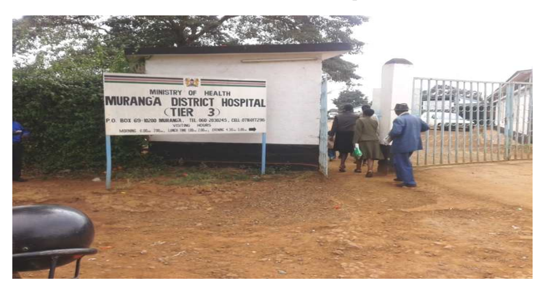
Figure 4.1: The front gate of Murang'a District Hospital

A total of one hundred and eight (108) out of the intended one hundred and ten (110) PMTCT clients were interviewed at the hospital. On the other hand, a total of nine (9) out of the intended ten (10) health workers were interviewed.