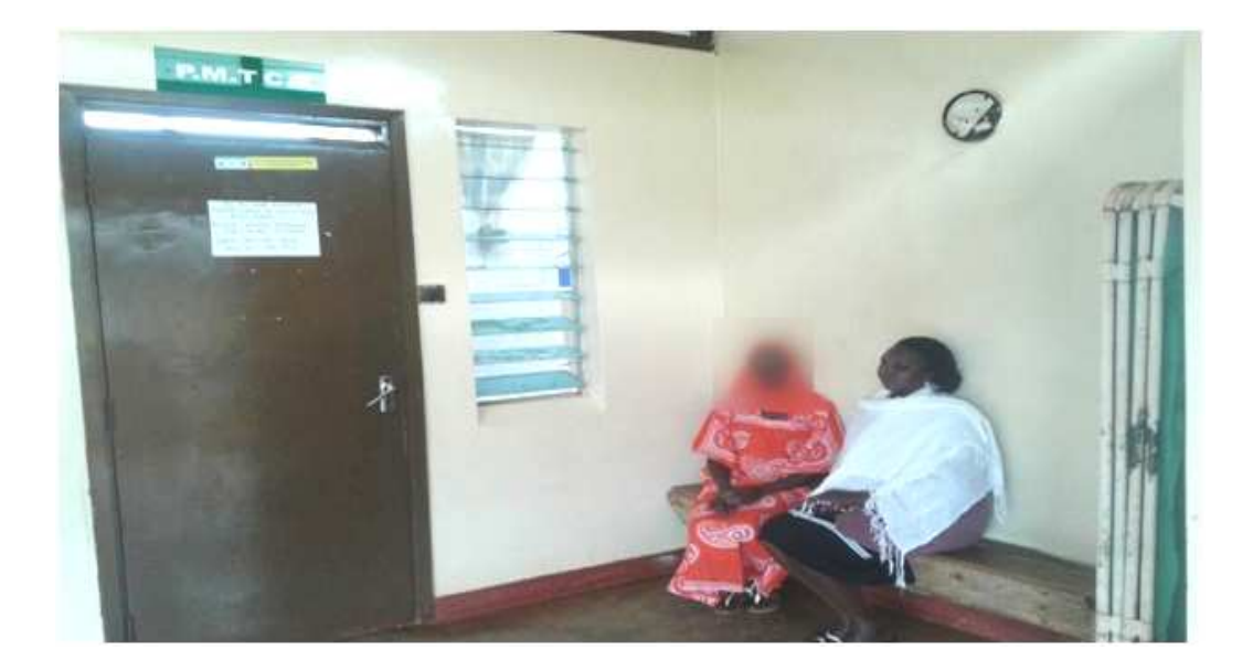
Figure 4.4: A female peer educator (Mentor Mother) gives peer counseling to a client outside the PMTCT consultation room

"Engage male peer educators and male HCW"