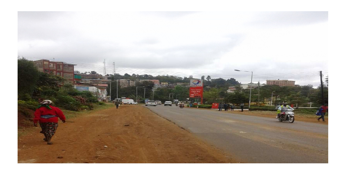
Figure 5.1: the main road leading to Murang'a Town