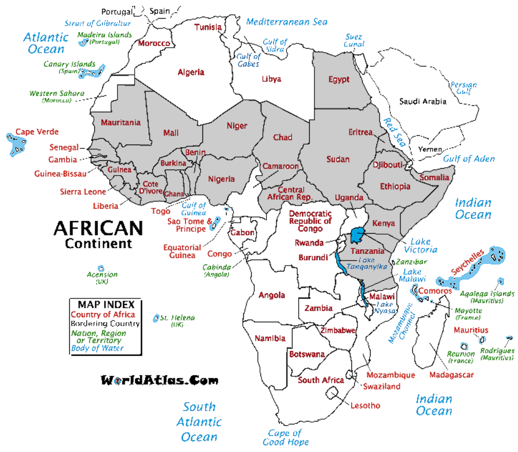
Figure 1: Location of places where FGM is practiced.