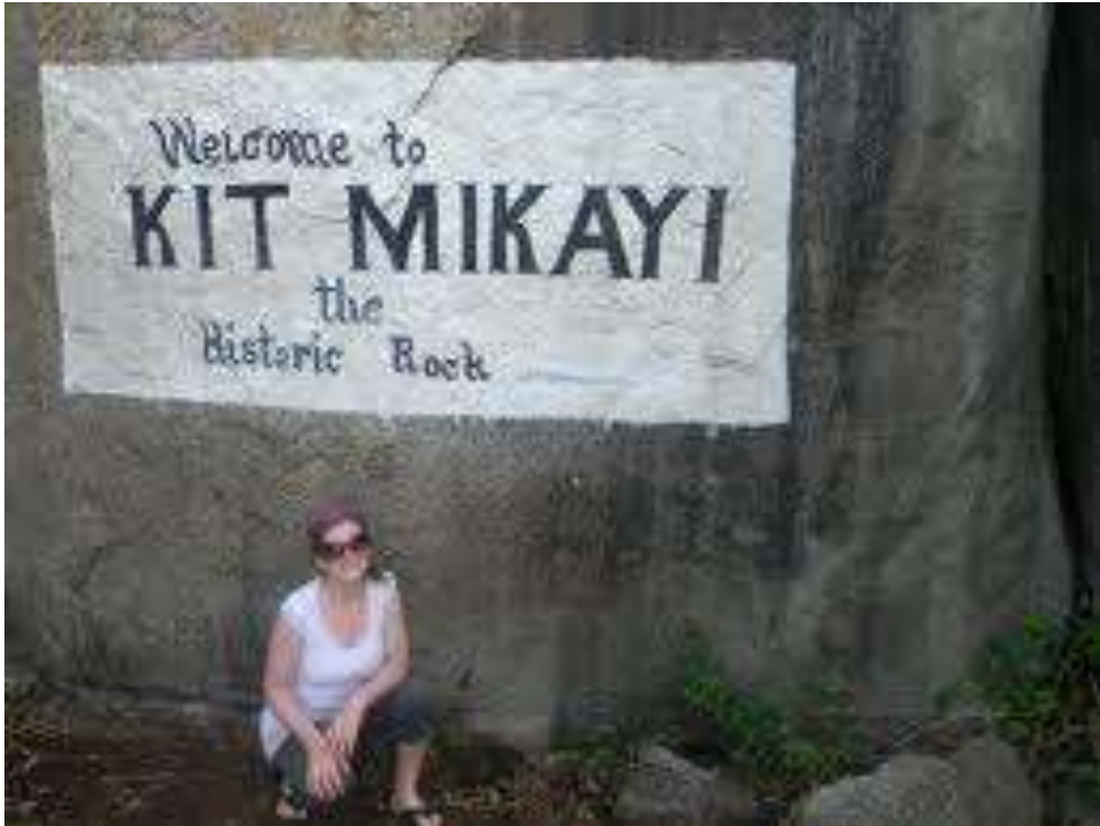
A tourist at the foot of Kit Mikayi rock