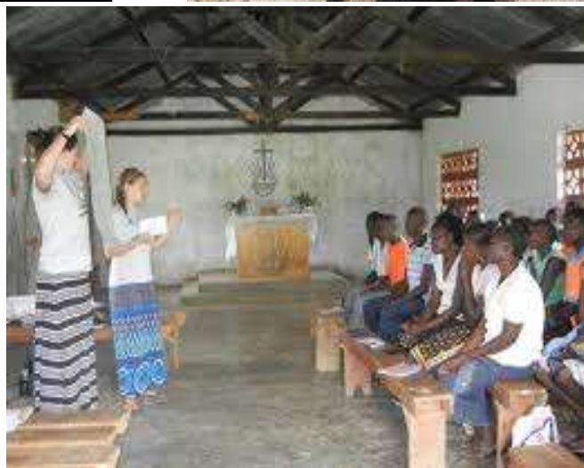
Some of the images and activities that take place in and around Kit Mikayi Tourists' site