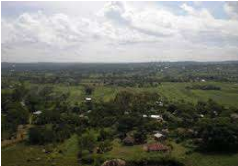
This is part of the community on which Kit Mikayi tourists' site is situated