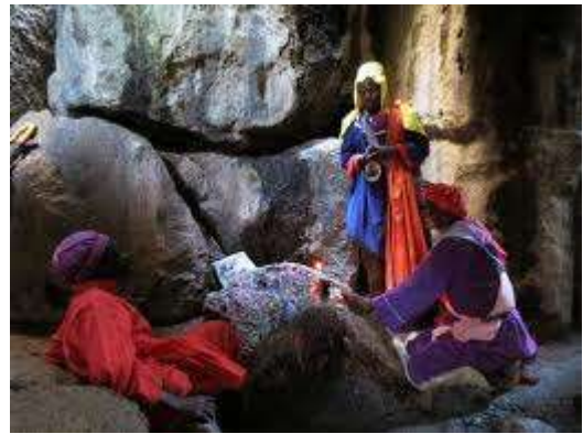
Characteristics of the activities that take place in the study area