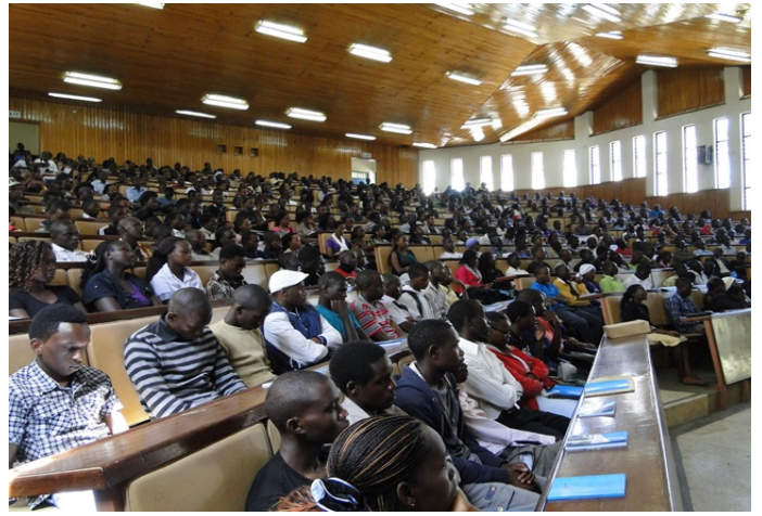
Orientation of first years