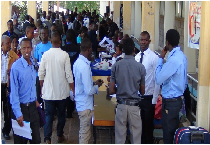
First year's registration process