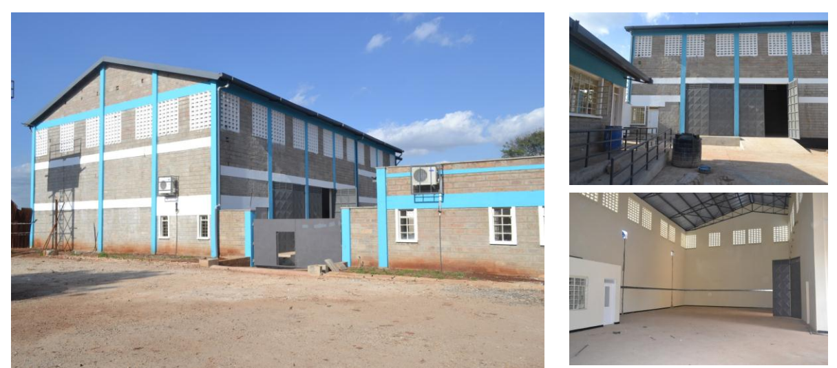
The seed processing factory constructed at the field station is complete and soon a seed processing line will be installed in the facility

In order to maximize benefits of seed for the small-scale farmer, SEMIs is also developing infrastructure for certified seed production. The SEMIs seed processing unit constructed at the field station (CAVS) will have a production capacity of over 5 metric tons of seed per hour upon completion. This unit will be used for processing of certified high quality seed for UNISEED, the university of Nairobi seed company. It will also be available for processing of seed from seed companies that do not have processing facilities.