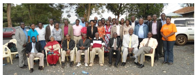
Members of department celebrating retired colleagues at the Faculty Club-Kabete