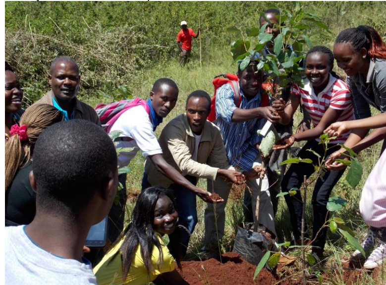
CAVS Students and staff in the process of plant tree seedlings during tree planting at Kanyariri Vet Farm on 4th April 2014