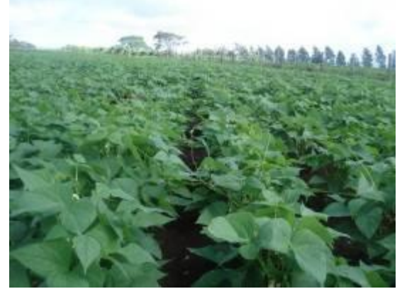
Bean seed crop at field station at CAVS

Apart from training seed practitioners SEMIs is also involved in bean Seed production at CAVS. One of the major challenges for food security is availability of foundation seed that is required by seed companies for seed bulking and production of certified seed. SEMIs is producing Breeder seed of high yielding bean varieties developed and bred at UON and in the process helping seed companies upscale seed production and ensuring the benefits of research in the form of new varieties developed are accessible to the end user who is the small scale farmer.