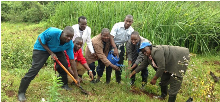
This is it as it has to be done. CAVS staff and some student leaders get down to business of planting tree seedings during the tree planting in November 2013 at Kanyariri Veterinary Farm.

Indeed tree planting function is too good to miss and here as CAVS gets down to the really action of planting trees the Principal share a light moment with students and staff during the tree planting in November 2013 at Kanyariri Veterinary Farm.