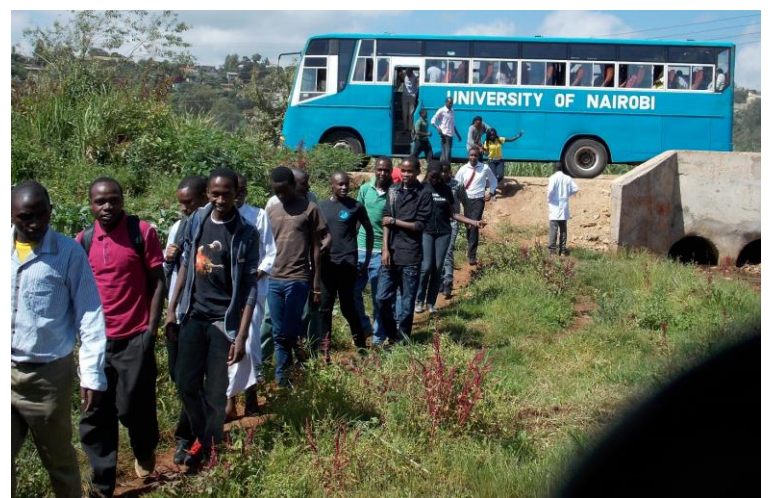
CAVS Students heading for tree planting at Kanyariri Vet Farm on 4th April 2014