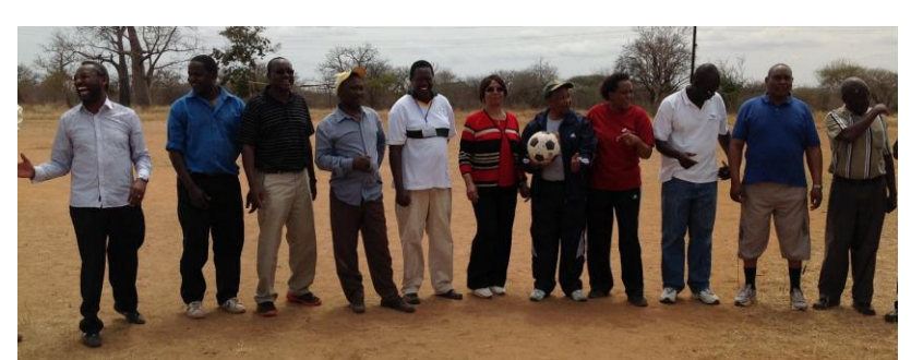
CAVS CMB Members during a team building session in Kibwezi Field Station in August 2013