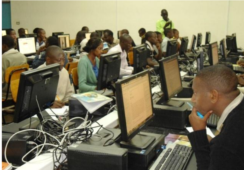
Students in the Faculty of Agriculture Computer Laboratory