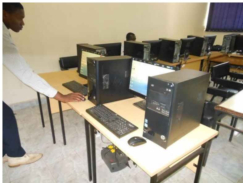
The LARMAT Geographical Information System Laboratory (GIS)