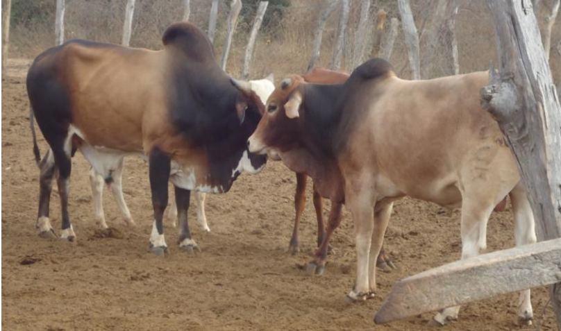
Beef Bulls at Kibwezi Field Station: August 2013

CAVS College Management Board (CMB) visiting Kibwezi Field Station during the CMB Retreat in August 2013