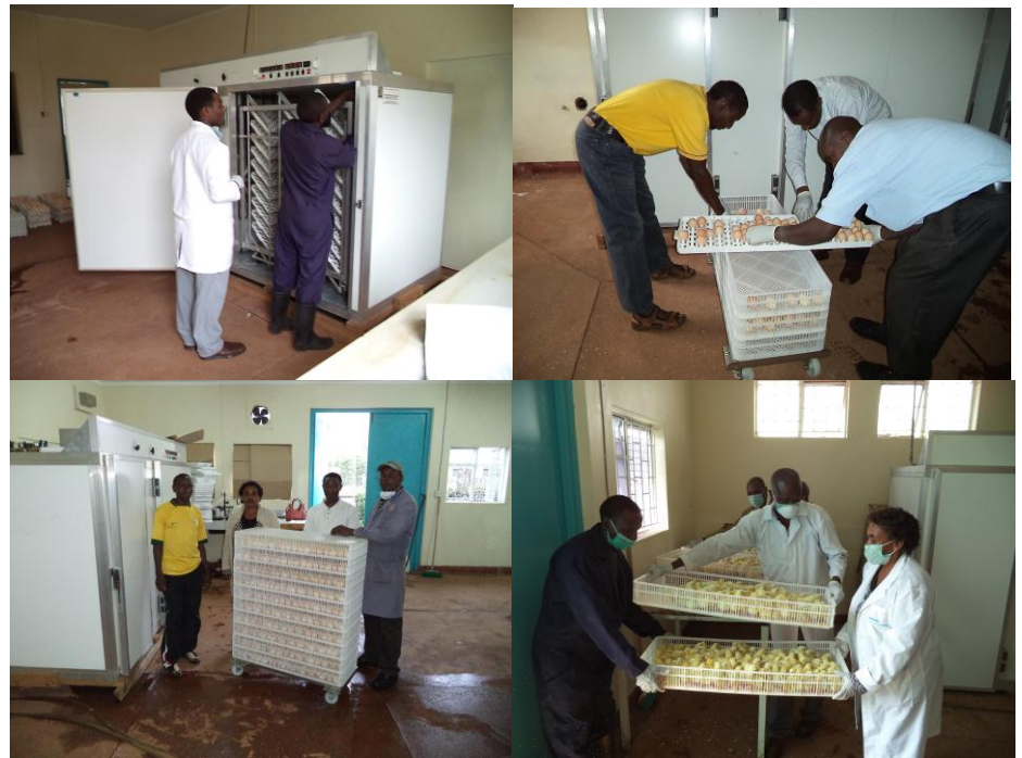
Staff preparing the hatchery, loading eggs on the trays, loading eggs to the incubator and collecting day old chicks