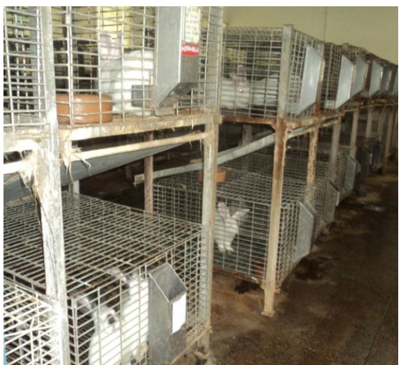
Part of the rabbitry unit at the Department of Animal Production

So far we have the New Zealand white and California White breeds. This rabbit have been presented at the ACK Nairobi International Trade Fare 2013 where the Department won the following awards