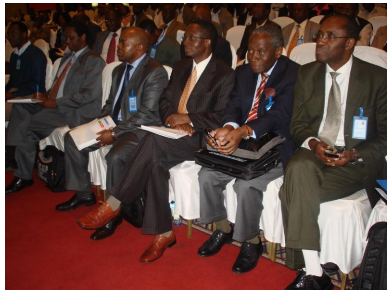
A session of 8<sup>th</sup> biennial scientific conference of the Faculty of Veterinary Medicine in progress at Safari Park Hotel in April 2012