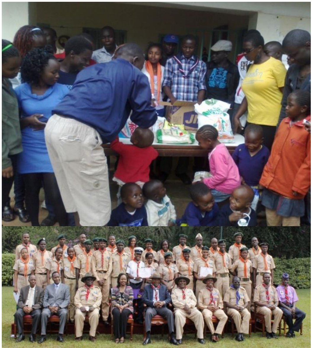
CAVS ROVER SCOUTS at Nairobi children's home giving donations Rover scouts service team at State house with the Kenya Scouts patron during scout's patrons day.