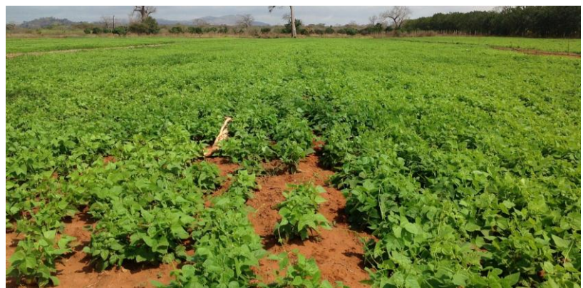
Seed Bean crop in Kibwezi field Station-August 2013

CAVS College Management Board (CMB) visiting Kibwezi Field Station during the CMB Retreat in August 2013