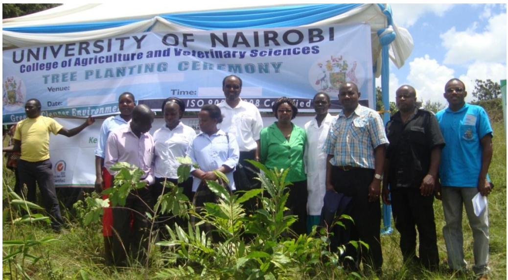
Library Staff at a Tree Planting Ceremony.