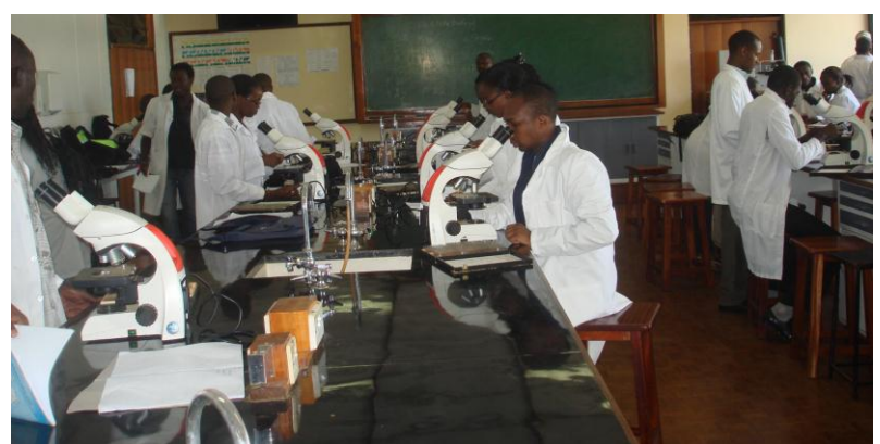
A practical class in session with individualized microscopy per student in the Department of Veterinary pathology Microbiology and Parasitology

Postgraduate students in a demonstration on Electron Microscopy at the Department of Veterinary pathology, Microbiology and Parasitology