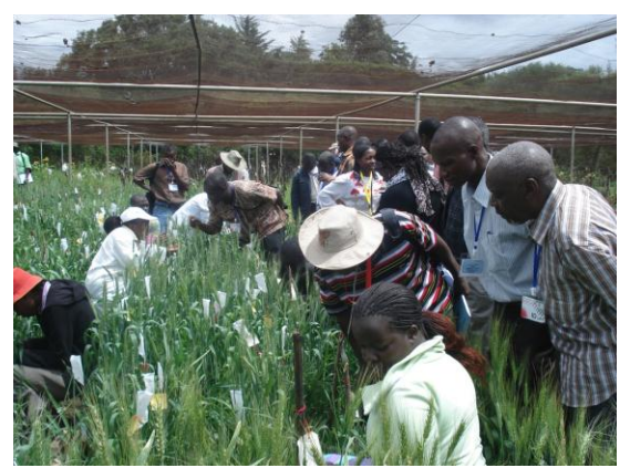
SEMIs concentrates a lot on experiential training-SEMIs participants on a visit to the Njoro wheat breeding facility