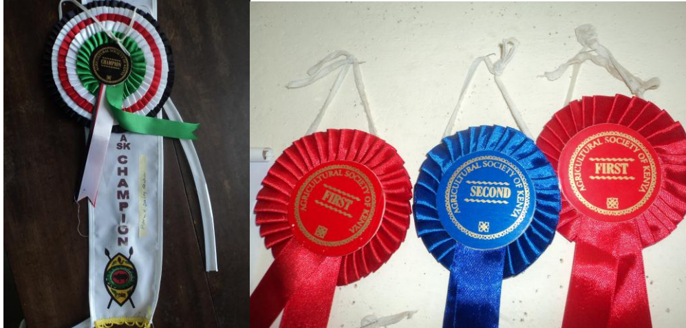
Some of the awards won at the 2013 ACK Nairobi International Trade Fare