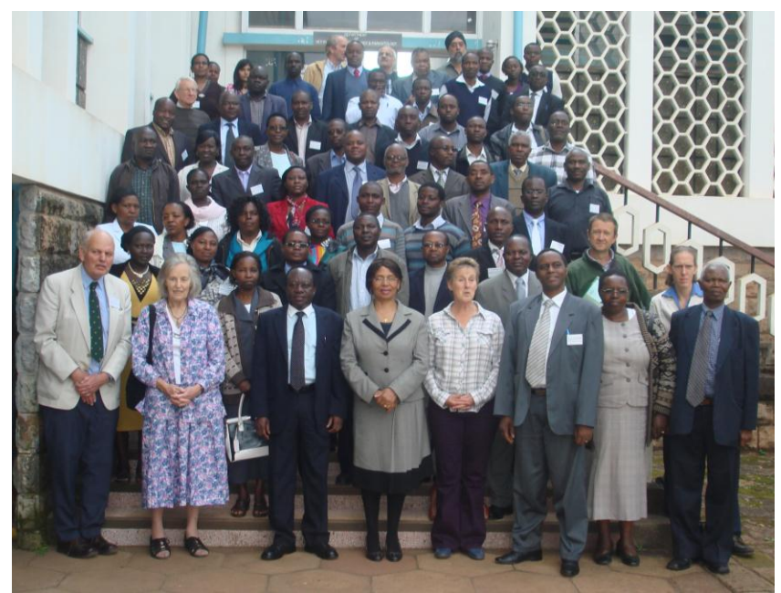
Birds of Prey workshop participants at the Department of Veterinary Pathology, Microbiology and Parasitology on July 3, 2013