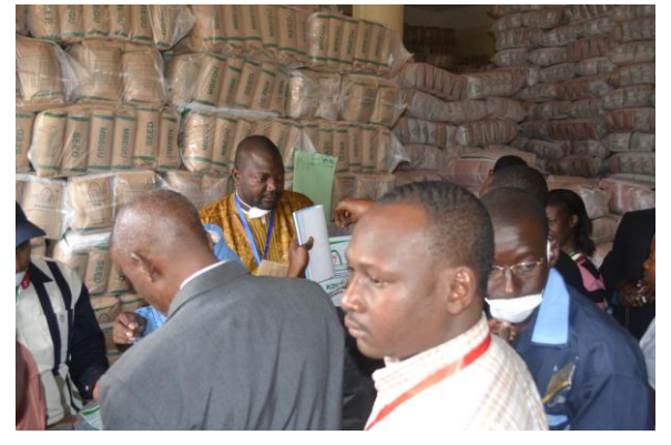
SEMIs participants on visit to Dryland Seed company in Machakos Kenya

The SEMIs instructors and facilitators are drawn from the University of Nairobi, KEPHIS, KARI, Iowa State University, CIMMYT, seed companies and other public and private institutions engaged in the seed value chain.