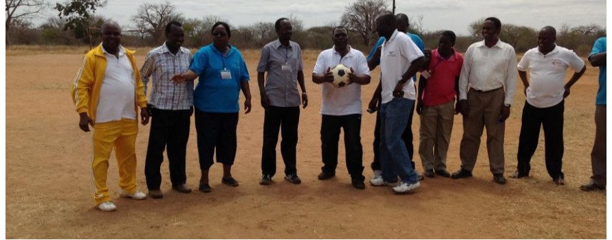
CAVS CMB Members during a team building session in Kibwezi Field Station in August 2013