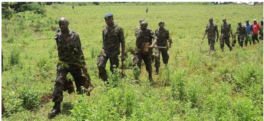
The Kenya Defence Forces from Eastleigh Moi Airbase joined the University community and other partners such as KTDA in tree planting on April 19, 2013 at Vet Farm, Kanyariri.