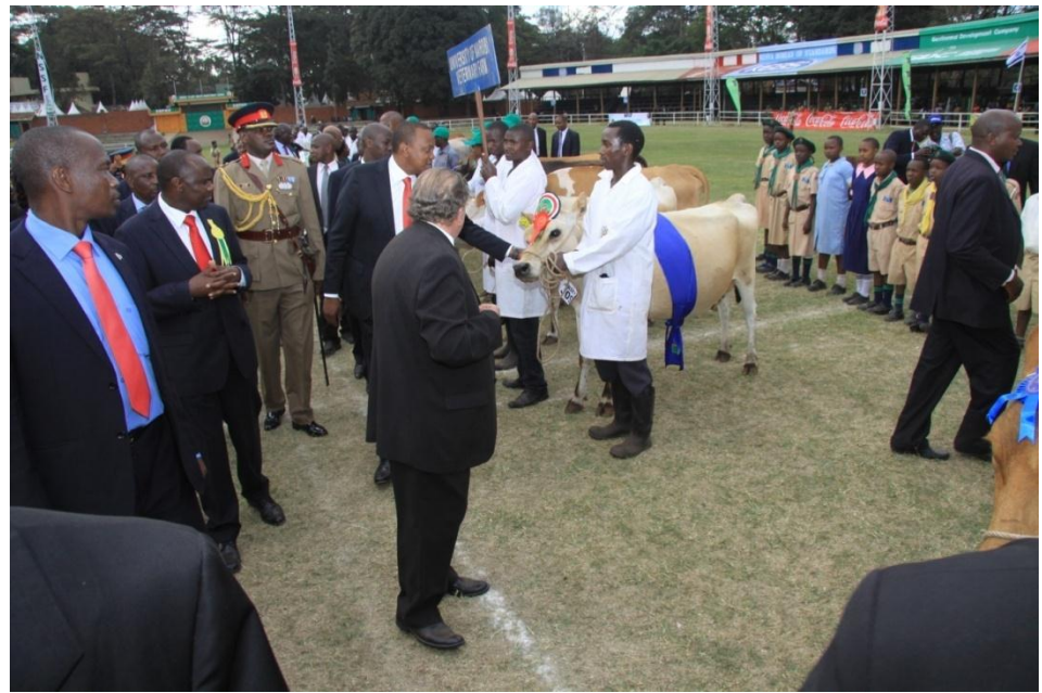
President Uhuru Kenyatta admiring the champion Jersey cow Naomi 560 during the livestock parade in the 2013 NITF