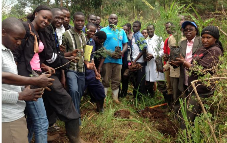
CAVS staff and students having fun as they prepare to plant seedlings in November 2013 at Kanyariri Veterinary Farm.

CAVS in fulfilling one of her core values of nurtutring and caring for the environment plants trees twice per year at the farms under the College mandate and care. These include upper Kabete campus, Kanyariri Veterinary Farm, Ngong forest and Kibwezi field station. CAVS does proactively engage with neighboring communities and other stakeholders in tree planting.