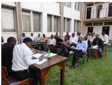
Above: DVAP Welfare Annual general meeting was held on 28th November 2013.