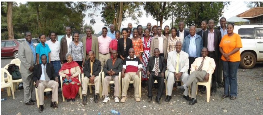
Members of department celebrating retired colleagues at the Faculty Club-Kabete