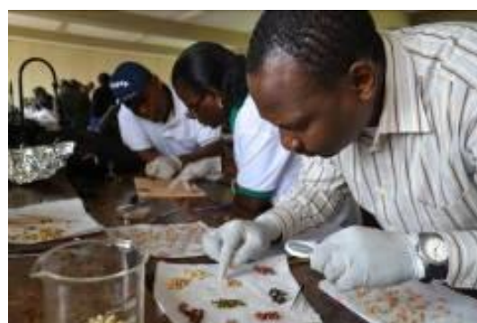
SEMIs laboratory practical sessions at CAVS