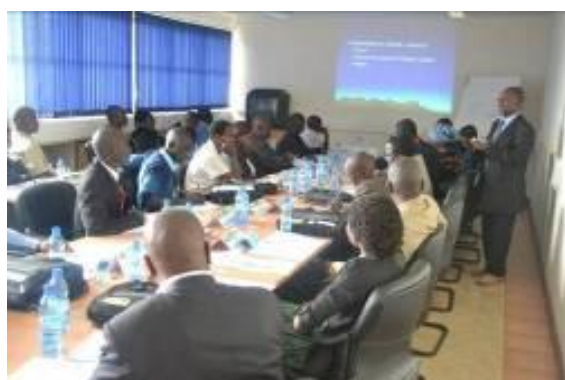
SEMIs Lecture session at the College of Agriculture and Veterinary sciences (CAVS)

The technical knowledge acquired at SEMIs by these seed company personnel is translating into increased seed volumes and enhanced quality of seed resulting in increased food production and poverty alleviation within the continent. SEMIs is also enhancing linkages between individual seed companies, and seed companies and public and private institutions for improved business.