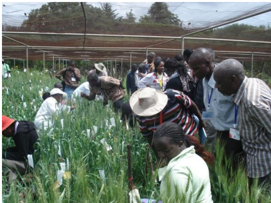
SEMIs concentrates a lot on experiential training-SEMIs participants on a visit to the Njoro wheat breeding facility