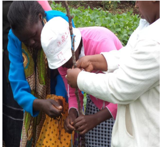
Participatory farmer technology selection exercise conducted at Mwea in 2013 by the ASARECA snap bean Integrated Crop Management Project implemented by UoN