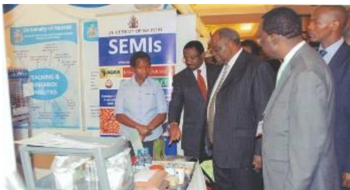
SEMIs was represented at the Agricultural Sector development Forum (2012) which was graced by H.E. President Mwai Kibaki of Kenya

To bridge the gap on seed information, the project has a website www.semis-africa.org that is a one-stop shop for seed-related information. SEMs staff also actively participate in agricultural conferences, meetings and workshops both within and without the African region.