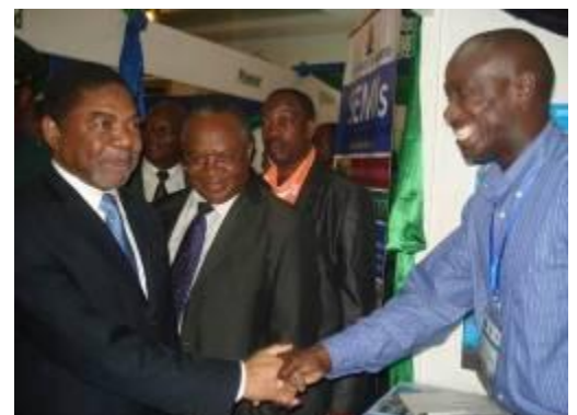
H.E. Mohamed Shein, president of Zanzibar visits the SEMIs stand at the African Seed trade Association (AFSTA) congress in Zanzibar in February 2012.