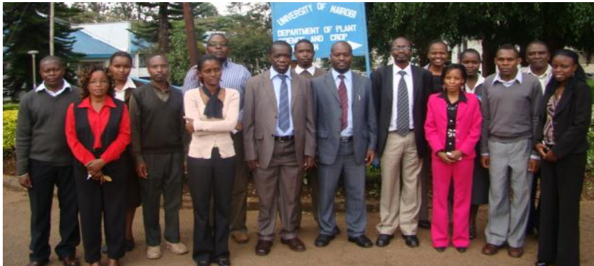
Photo during hands on training of technical staff on RT PCR in our Molecular Genetics Laboratory