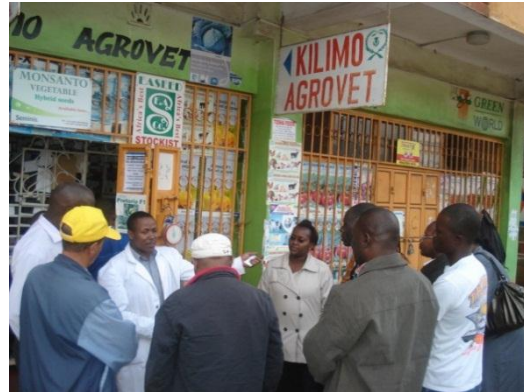
SEMIs participants visiting an Agro-dealer shop to familiarize with movement of seed in the seed value chain.