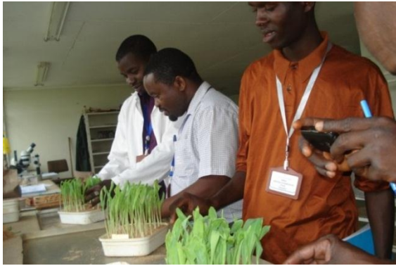
SEMIs seed practitioners in a lab session at CAVS