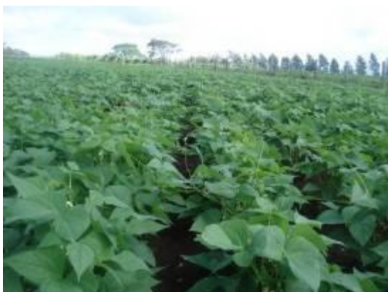
Bean seed crop at field station at CAVS

Apart from training seed practitioners SEMIs is also involved in bean Seed production at CAVS. One of the major challenges for food security is availability of foundation seed that is required by seed companies for seed bulking and production of certified seed. SEMIs is producing Breeder seed of high yielding bean varieties developed and bred at UON and in the process helping seed companies upscale seed production and ensuring the benefits of research in the form of new varieties developed are accessible to the end user who is the small scale farmer.