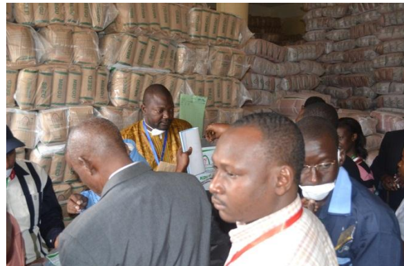
SEMIs participants on visit to Dryland Seed company in Machakos Kenya

The SEMIs instructors and facilitators are drawn from the University of Nairobi, KEPHIS, KARI, Iowa State University, CIMMYT, seed companies and other public and private institutions engaged in the seed value chain.