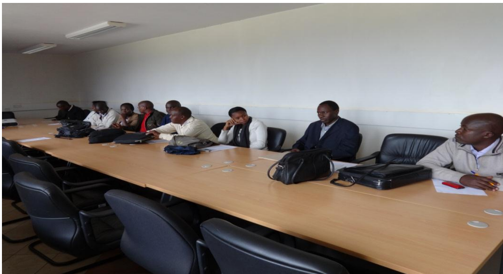
M.Sc. Agricultural Resource Management and M.Sc. Horticulture students on orientation in 2013