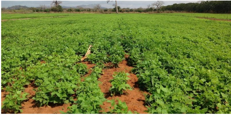
Seed Bean crop in Kibwezi field Station-August 2013