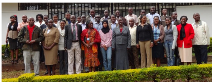
Staff and M.Sc. students at the launch of ODL M.Sc. Agricultural Resource Management (2013)