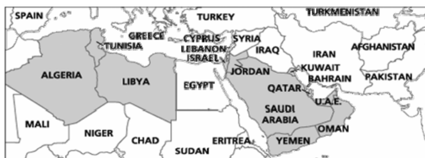
Figure 2. Water scarce countries in the Middle East and North Africa. Note: Water-scarce countries (shaded above) are those with less than 1000 m 3 of renewable freshwater per person per year 12 .