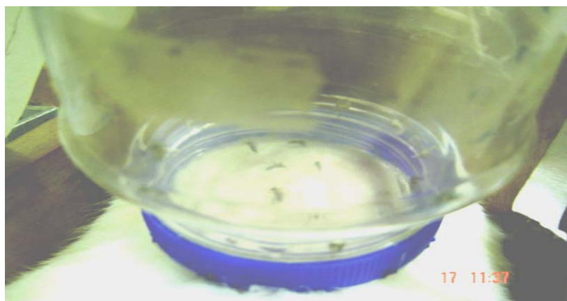
Fig 3: A Photograph showing Aedes aegypti female mosquitoes feeding on untreated rabbit skin