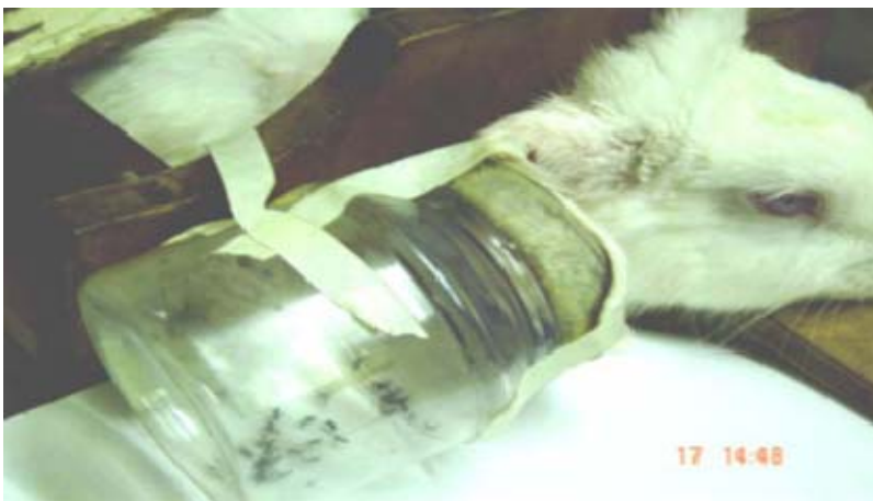
Fig 2: A photograph showing Aedes aegypti female mosquitoes paralyzed after application of Sweet basil oil on the rabbit ear (Front view)