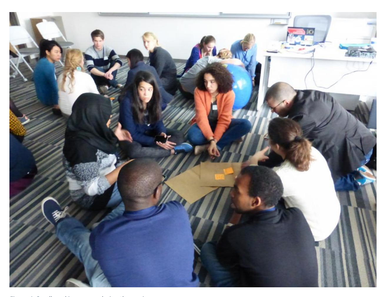
Figure 4: Small working groups during the sessions