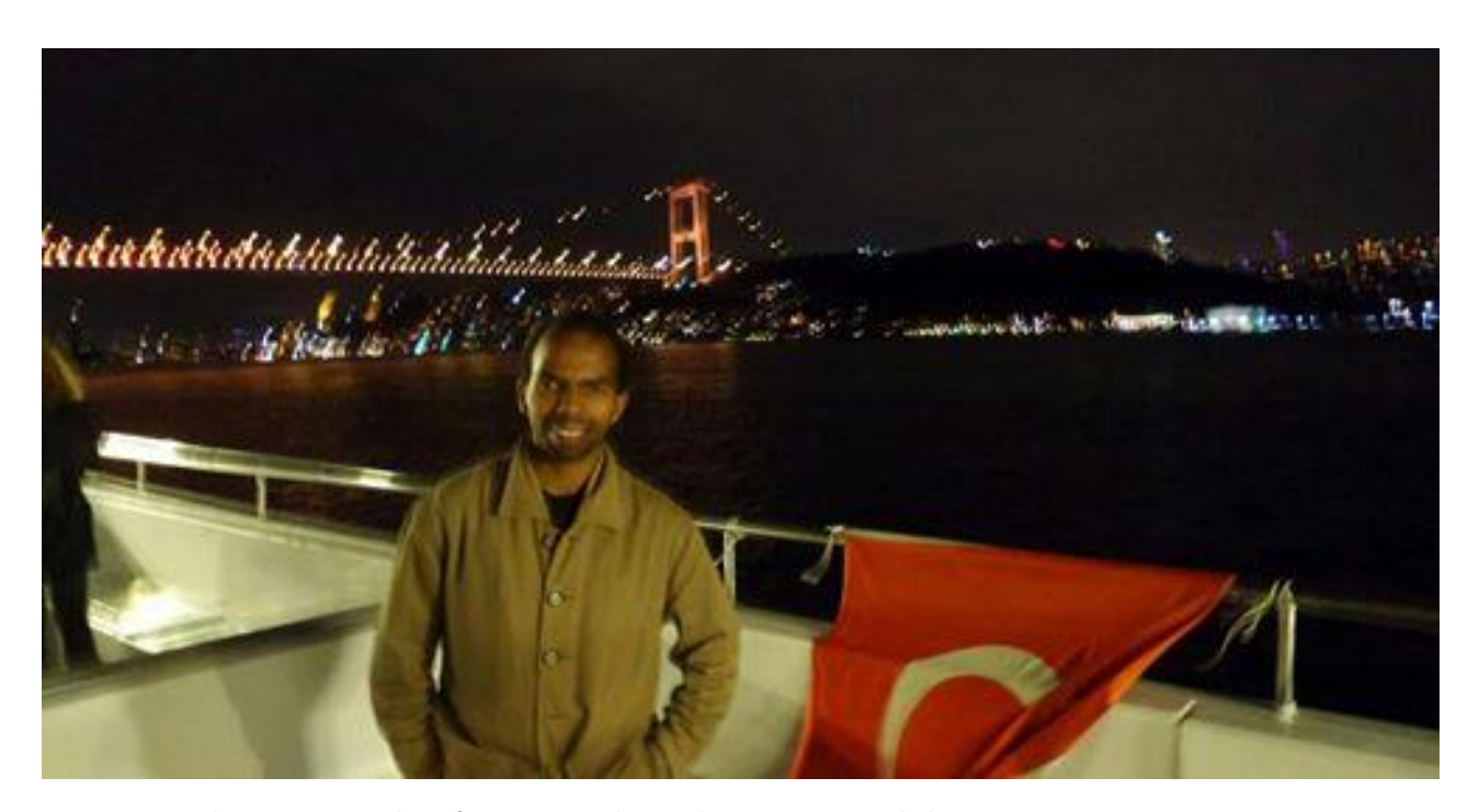
Figure 10: Social program, gone down for a cruise to the Bosphorus Srait at Istanbul