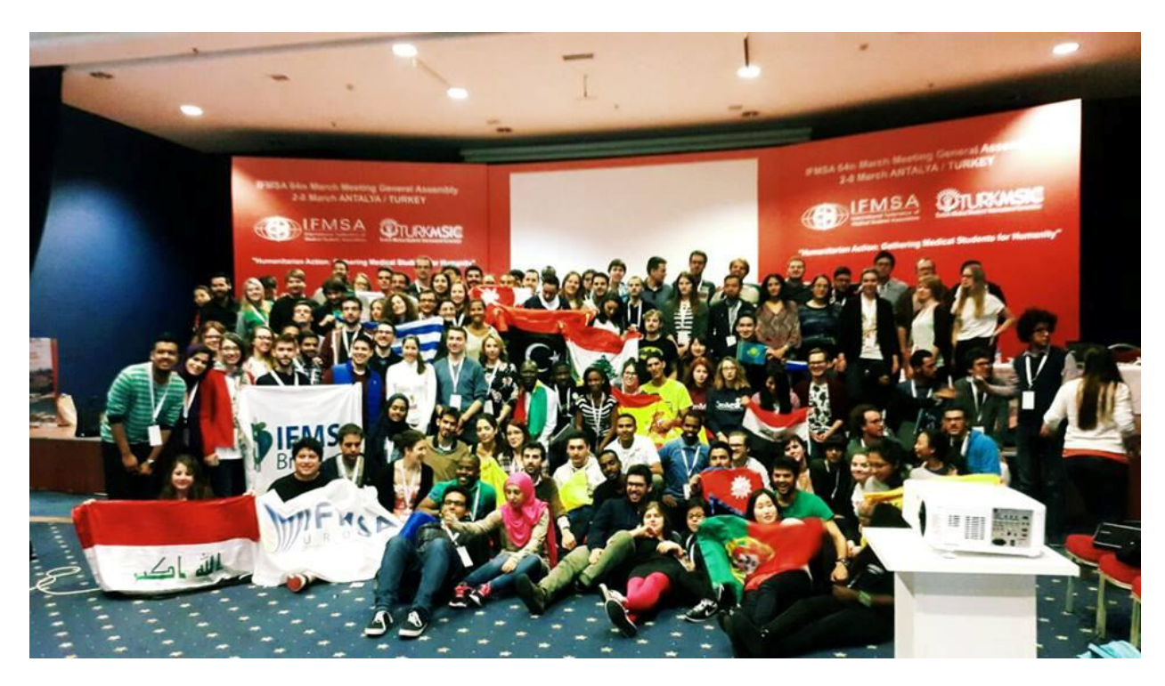
Figure 1: A representation of all the countries that attended the President's sessions