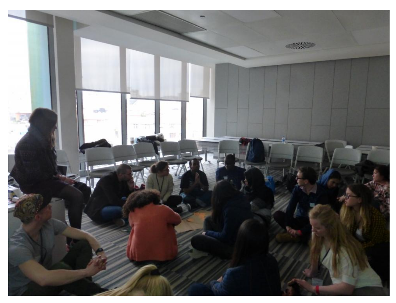
Figure 5: Discussions during the various sessions