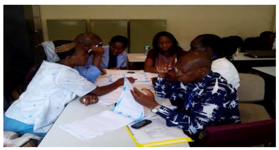
Group 3 Discussions DAY 3 (Wednesday 15<sup>th</sup> October, 2014)

The six groups presented their selected research questions to the rest of the MR team. The questions were critiqued by the class and the instructors. Each group was then assigned a coach who would help them refine their question and improve on it if need be.