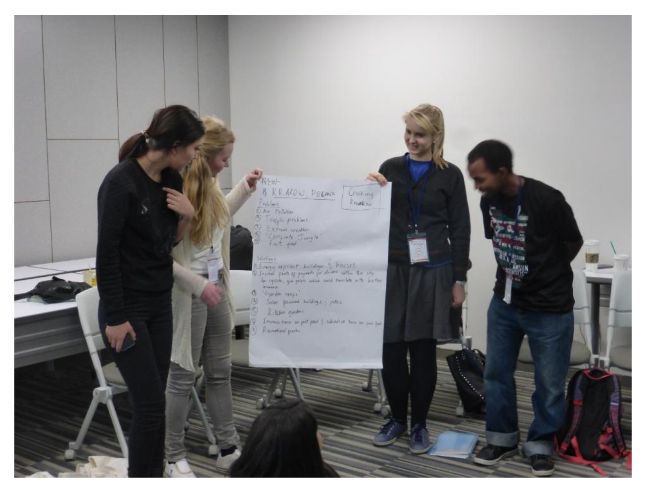
Figure 7: Presenting our findings to the rest of the group; represented Poland, Norway, Kazakhstan and Kenya