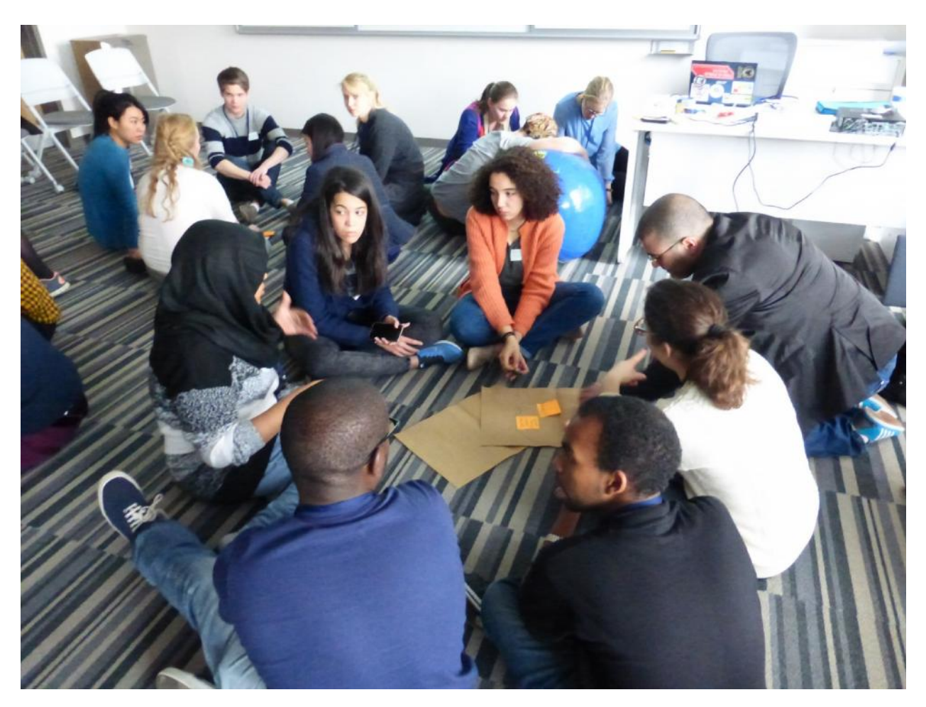
Figure 4: Small working groups during the sessions