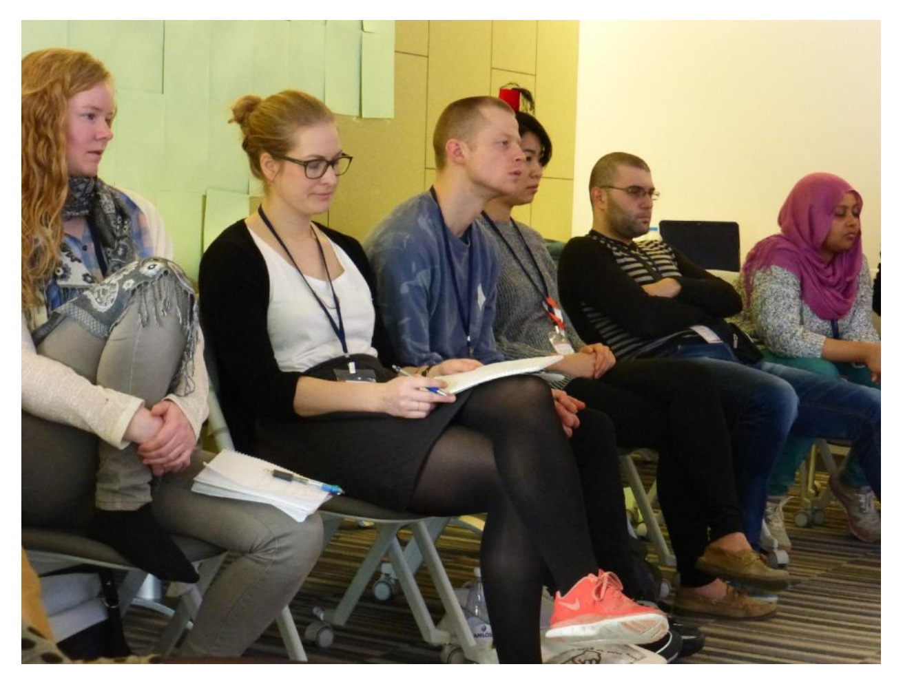
Figure 8: Discussions on going during one of the sessions; Represented countries; Norway, Denmark, Canada, Algeria and Sudan