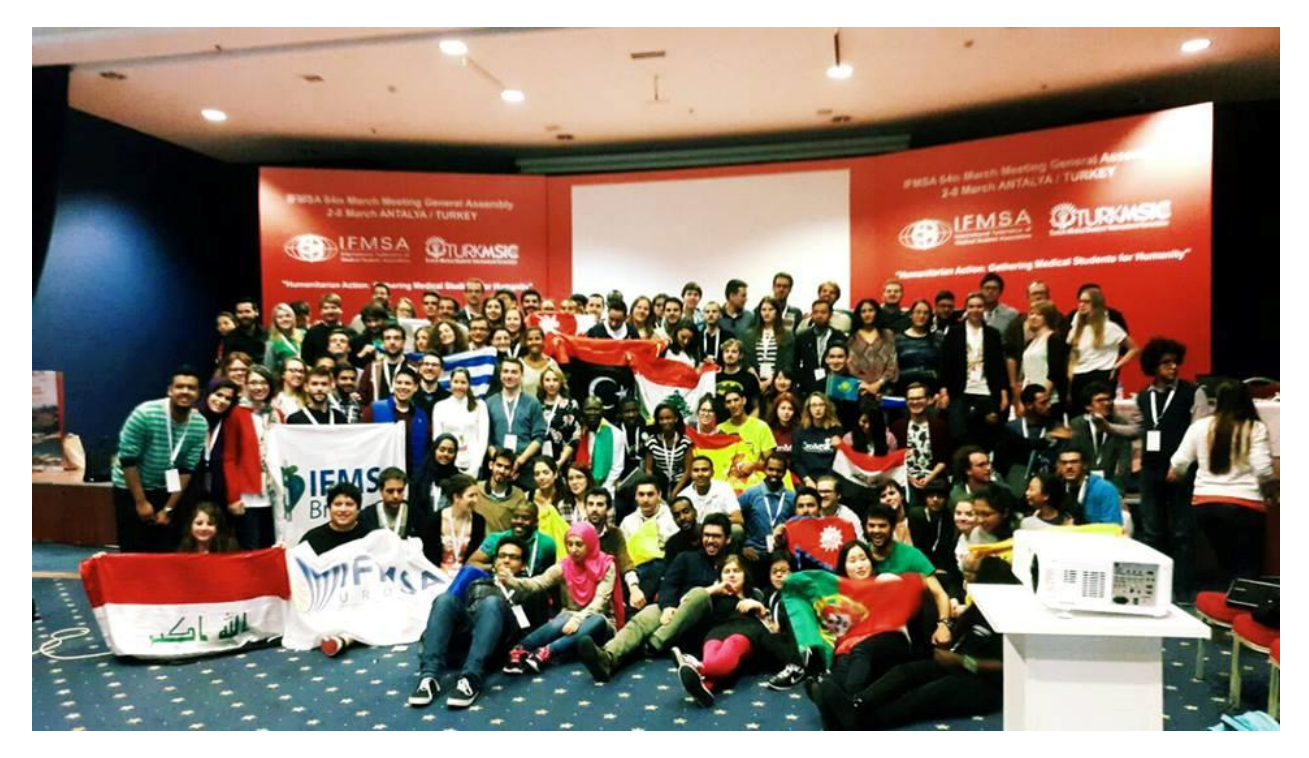
Figure 1: A representation of all the countries that attended the President's sessions