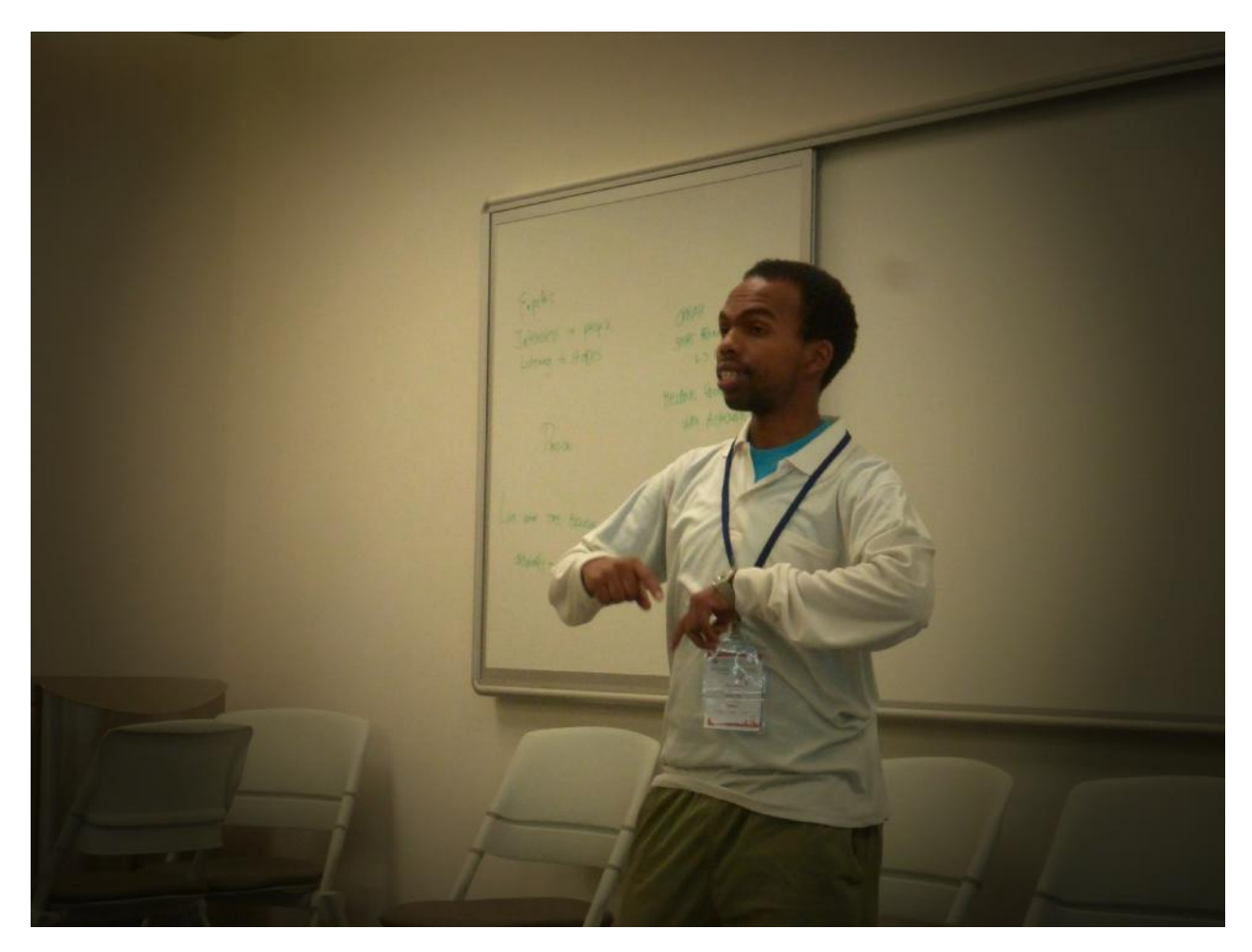
Figure 11: Illustrating a point to the rest of the group during my presentation in the session