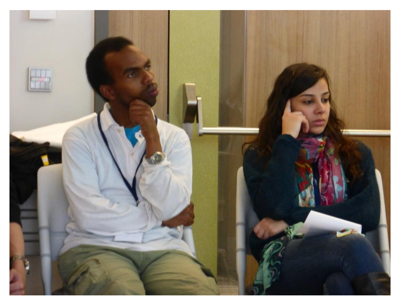
Figure 9: Focusing on the session that was ongoing