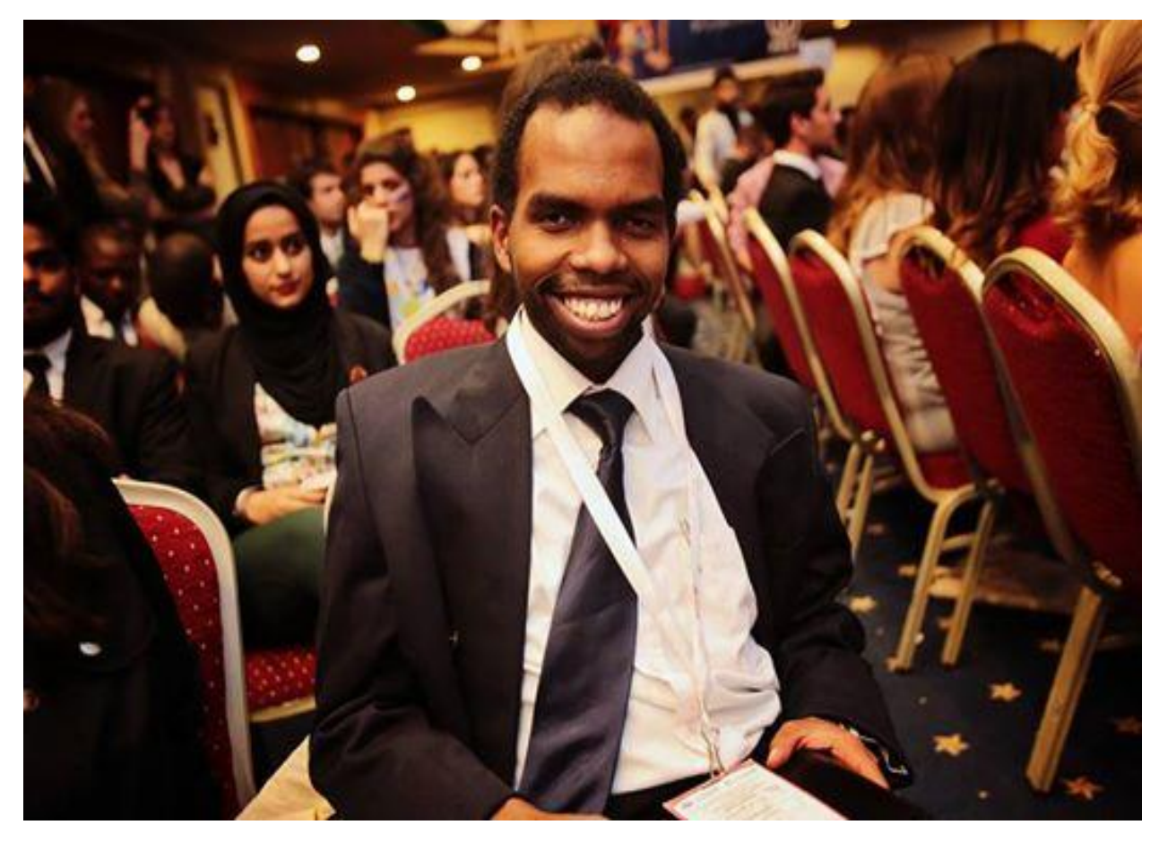
Figure 2: The opening ceremony of the General Assembly