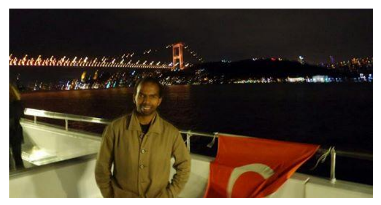
Figure 10: Social program, gone down for a cruise to the Bosphorus Srait at Istanbul