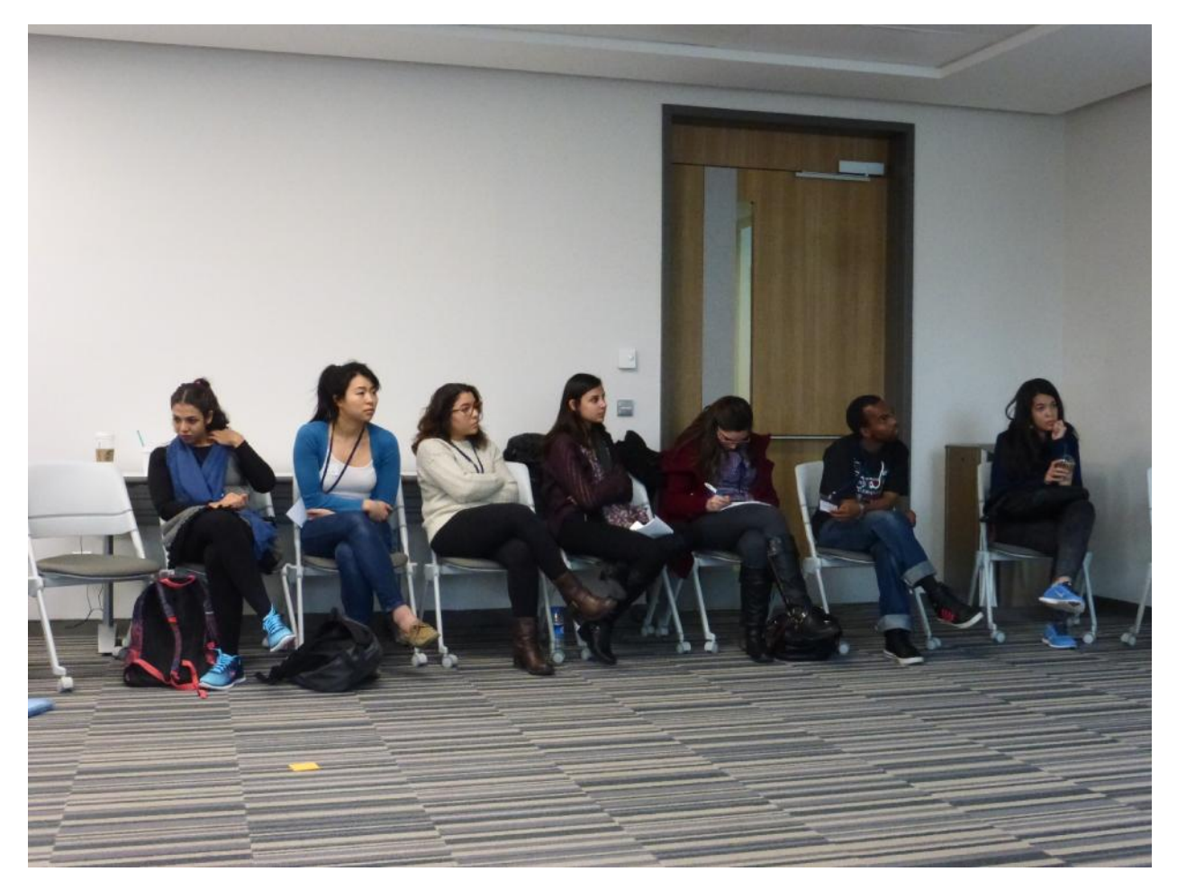
Figure 6: Various countries represented, Kazakhstan, Canada, Lebanon, Tunisia and Kenya