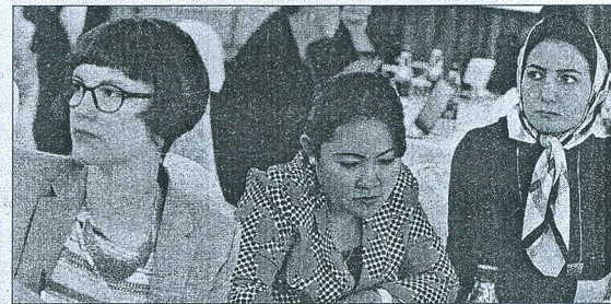
Participants at the International Conference on Agricultural Biotechnology and Biosafety Communications at Safari Park Hotel, Nairobi on Monday

He said Kenya had existing legal, human and infrastructural capacity to