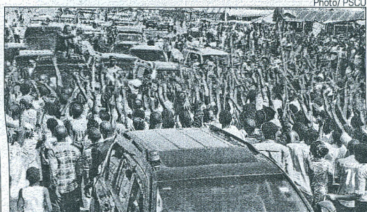
ROUSING WELCOME: President Uhuru Kenyatta acknowledges greetings from youth working in the NYS Youth Empowerment Project at Obunga Informal Settlement when he toured Kisumu yesterday.

"This is not the occasion for politicking, but I have to set the record straight. I am not against