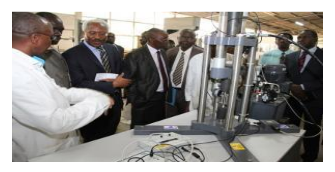
Some of the equipment donated by the African Development Bank to the School of Engineering.

The African Development Bank (ADB) is supporting various projects within the University of Nairobi to strengthen the quality of education.