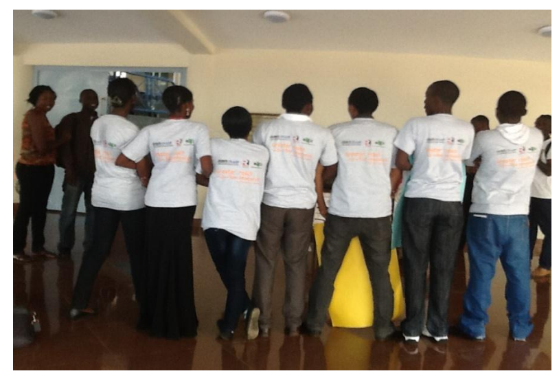
Kenyatta University Chapter