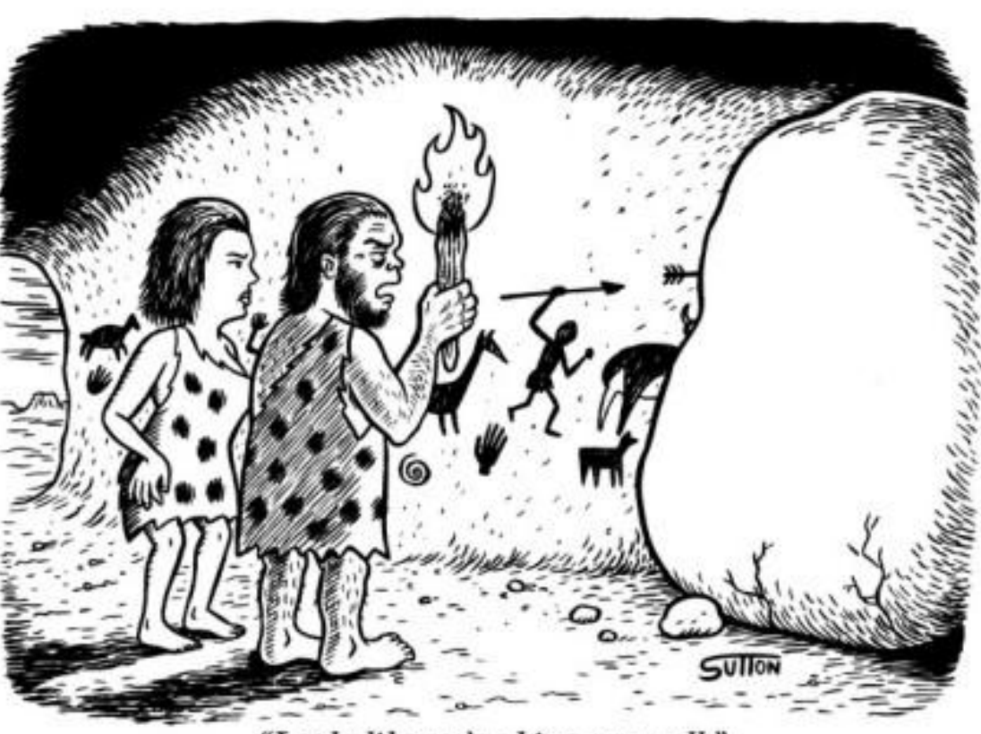
"Looks like we've bit a paywall."