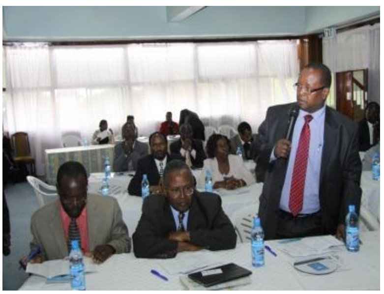
OA/IR Workshop, Aug 2012