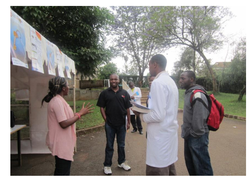
Moi University Chapter