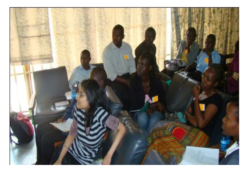
Joint OA Training