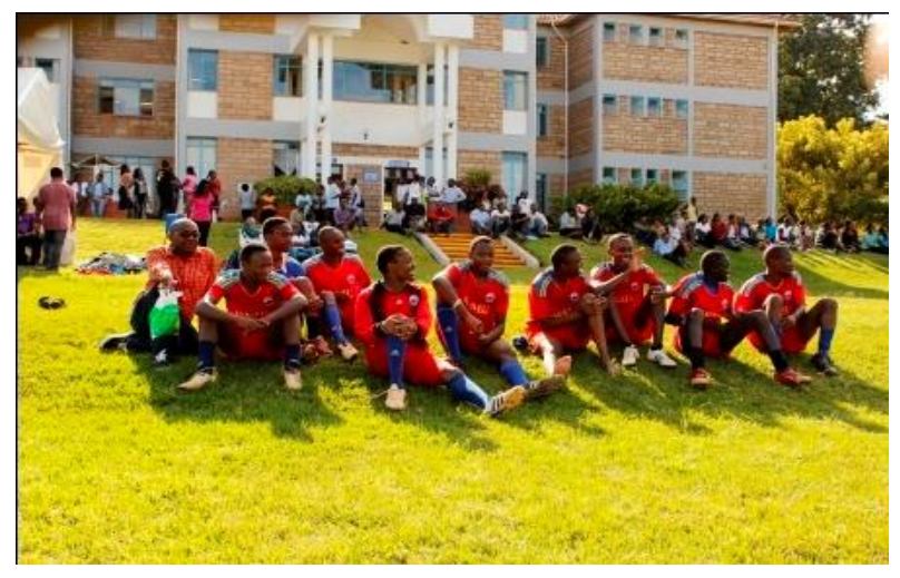
Methodist University Students