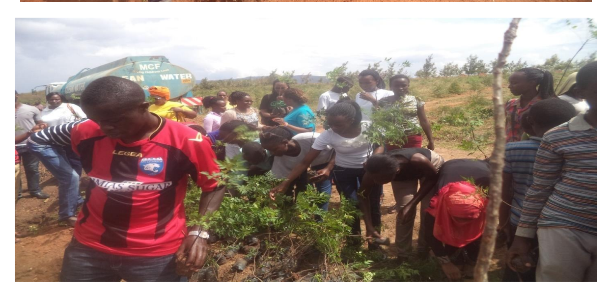
Tree planting was among the activities that took place during the visit, above is the CAVs staff and students interacting with the kids as they plant trees.