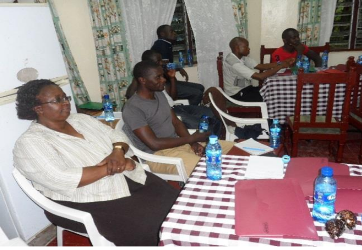
KCUSO chairman keenly following the training