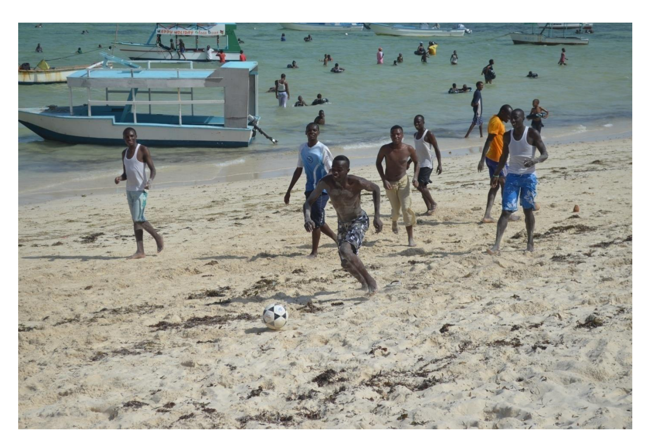
Soccer at the beach during the retreat