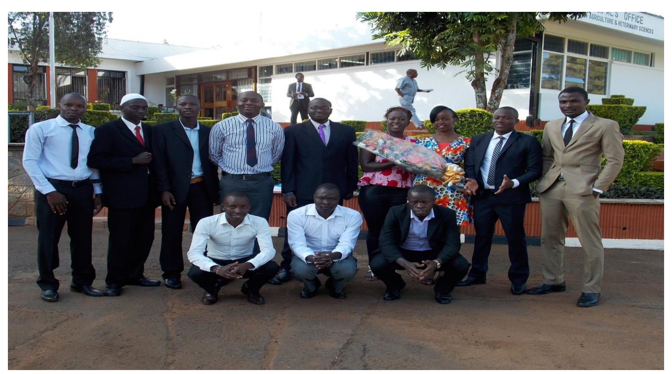
CAVs student leaders a waiting to receive the VC