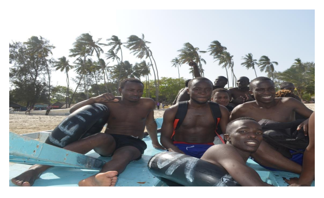
Students taking a boat ride during the retreat