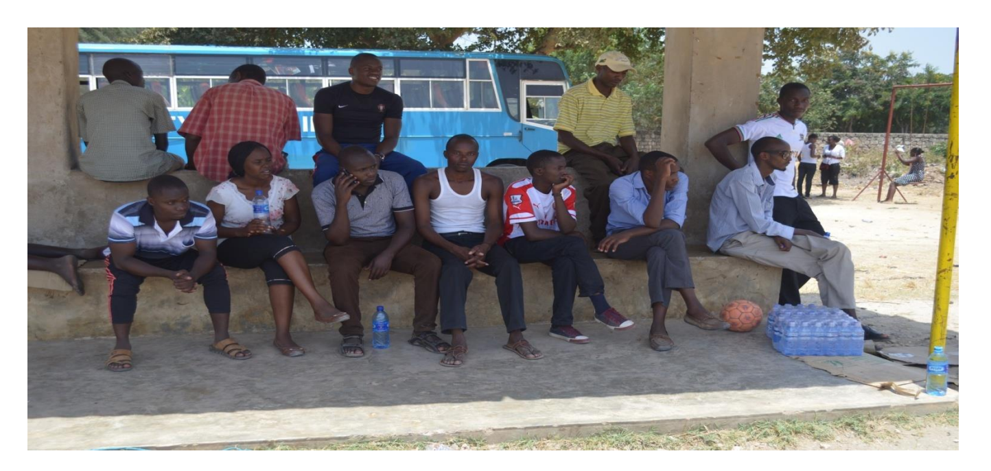
CAVS Students spectating a football match at the Mombasa sports club during their annual sports retreat to Mombasa

This is one of the sports events that acts as a motivation to support and enhances student's talents. It is an event to reckon as the administration has been so supportive in ensuring that the trip is safe, enjoyable and a success.