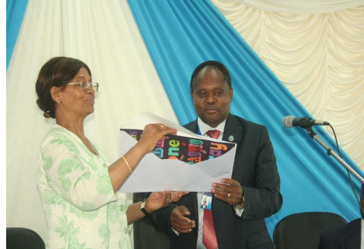
Left: VC Sharing some light moments with the KCUSO chair, and Right: Principal CAVS congratulates the VC on his appointment