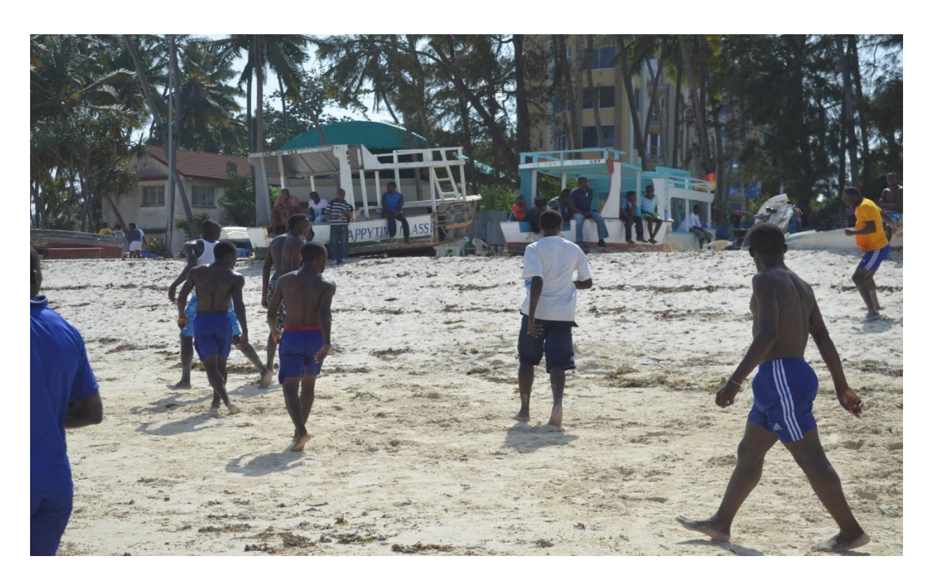
Cavs Sports men playing beach soccer at Pirates beach Mombasa.