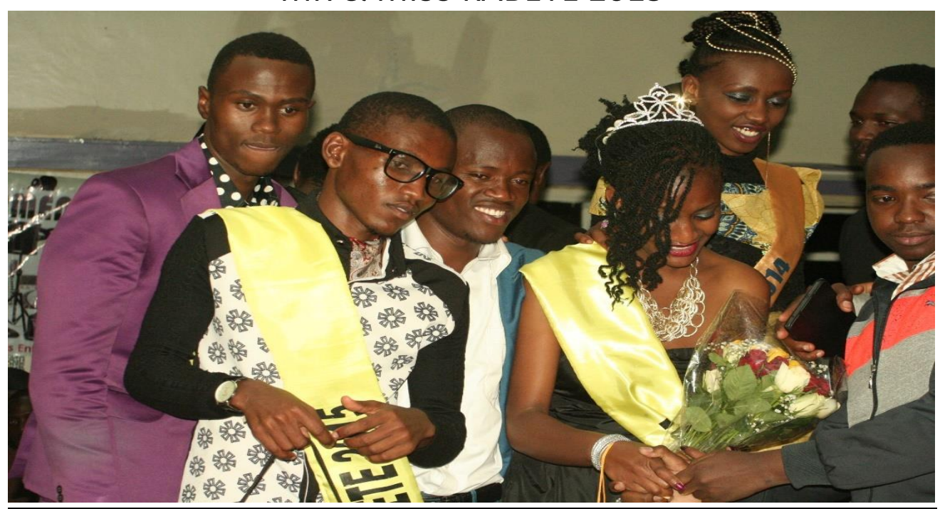
MR & MISS KABETE 2015