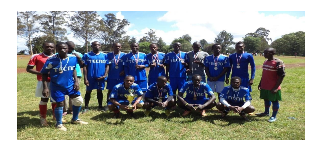
CAVS Team after lifting trophy and given medals