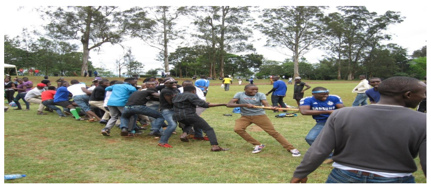
The battle of the titans between the freshers and finalists