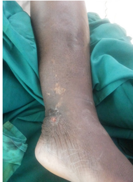
Figure 5. Photograph of the medial aspect of distal left leg shows the ulcer associated with proximal left common iliac vein occlusion. The ulcer had started drying up 24 hours after the stenting

To maintain radial strength against the pulsation of the overlying right common iliac artery, a second similar self expandable stent was deployment about 2 cm below the tip of the first stent (Figure 3). A final DSA venogram (Figure 4) showed good venous inflow into the IVC with non visualization of most of the pelvic venous collaterals. A Doppler ultra sonography done 24 hours after the procedure showed a patent left common iliac vein with a normal biphasic flow pattern. The wet venous ulcer had started drying up. A subsequent follow up CT venogram at 3, 6 and 12 months showed patent left common iliac vein .The left lower limb swelling had gradually resolved and venous ulcer in the distal medial leg completely healed. There were no pain symptoms and patient had returned to normal walking and use of the left lower limb.