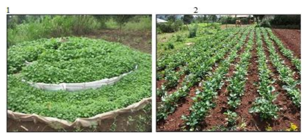
Figure 3. A caption of vegetable crops growing on 1 PILA and 2 Flat beds.

Table 4. Differences in the means of the agronomic indicators of selected vegetables on PILA structures and flat cropping beds for Jinja.