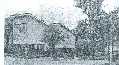
Arziki Gardens Restaurant, State House Road

For reservations please call : 020 2114239 or 020 2731862/1.Visit our website www.uneskenva.com/Arziki