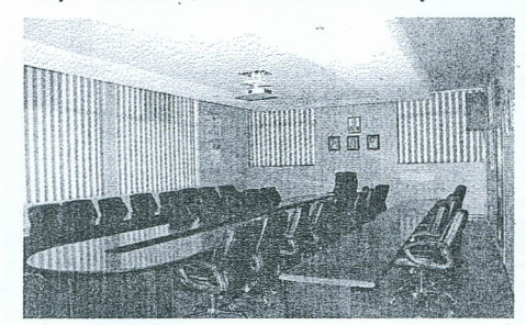
UNES Executive Boardroom

outside catering, office deliveries and conferencing facilities for small and large groups.