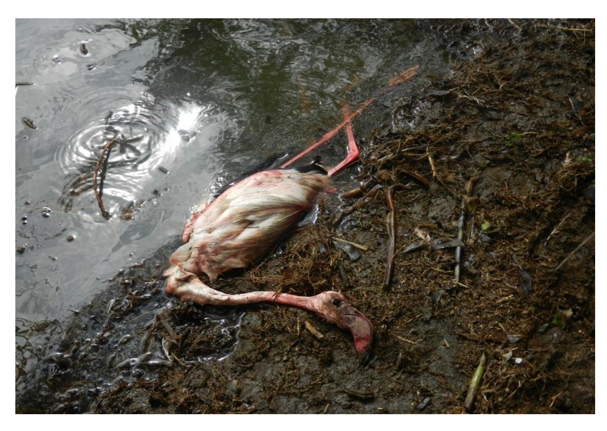
Figure 6: Dead Lesser Flamingo on the lake shore in Lake Oloidien, Nakuru County, Kenya