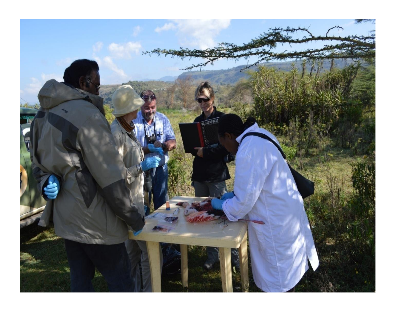
Figure 4: Dissection of Lesser Flamingo in Lake Oloidien, Nakuru County, Kenya