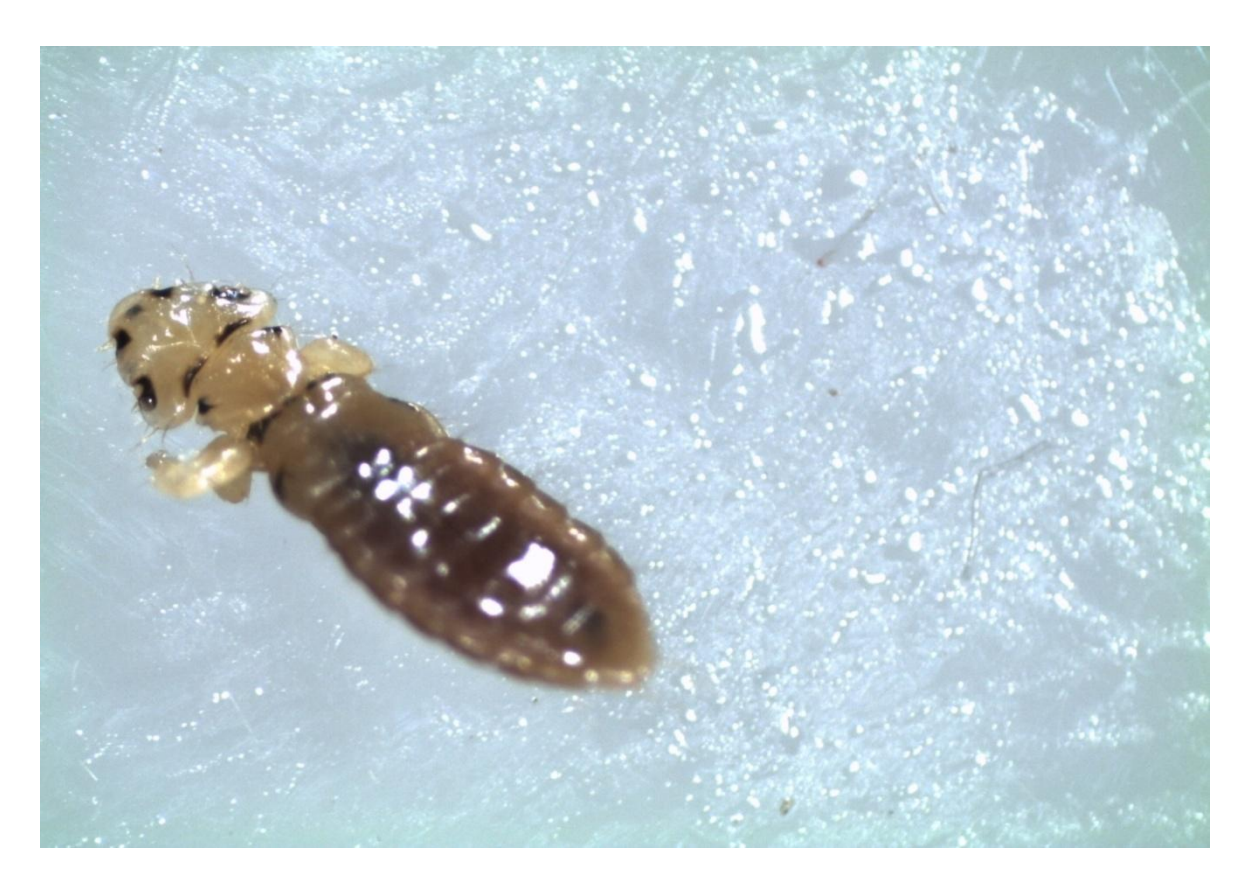
Figure 7: Anatoecus spp