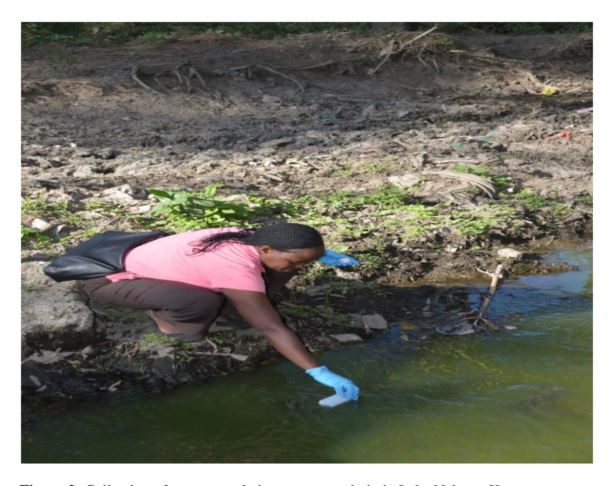
Figure 2: Collection of water sample in a sewerage drain in Lake Nakuru, Kenya