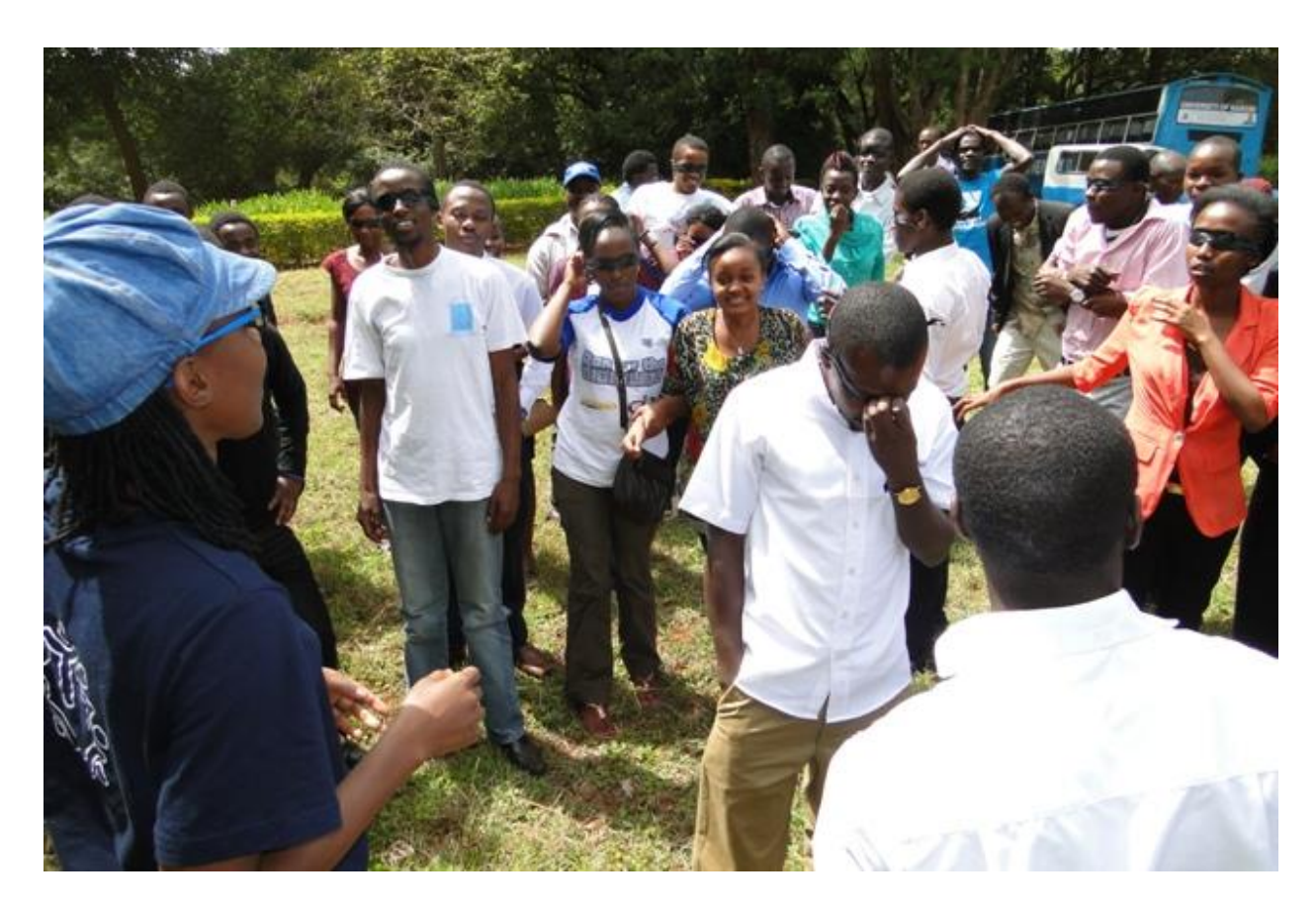
Leading a team is explained through a game