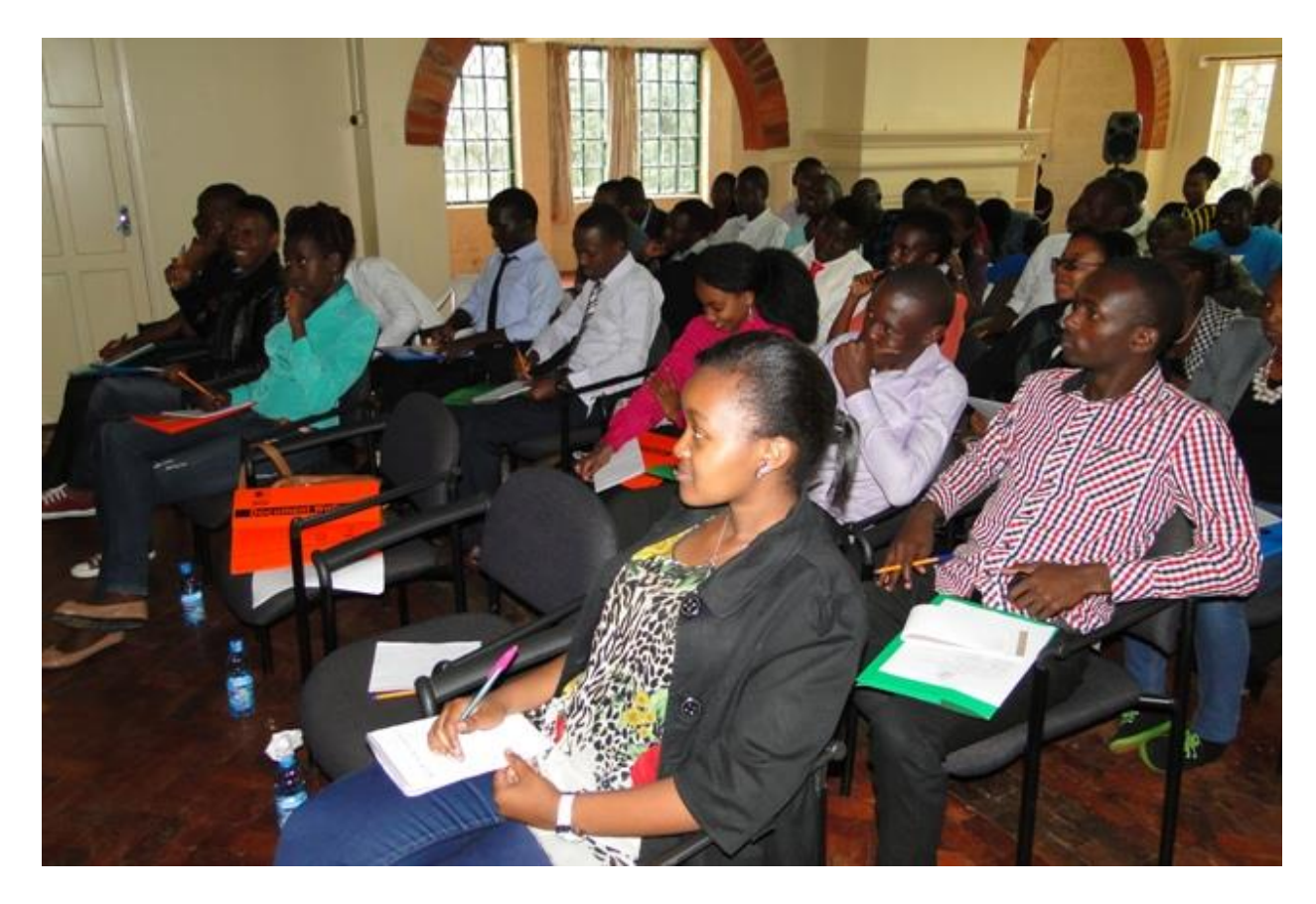
Student leaders listen attentively during the training