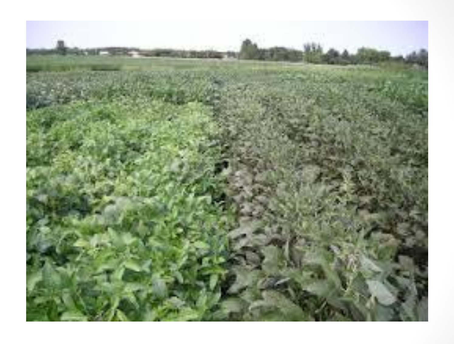
Border cropping or strip cropping or habitat manipulation