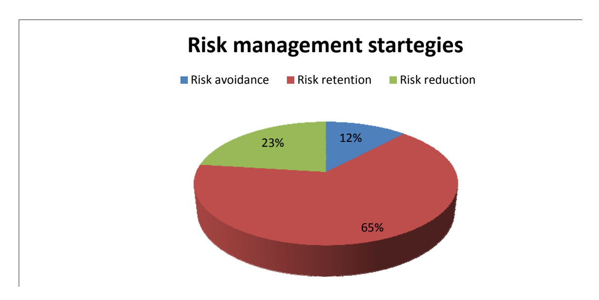
Figure 4. 3: Risk Management Strategies