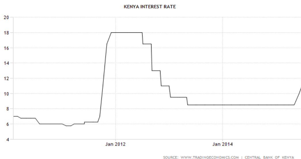
Figure 1 (The official interest rate since August 2010 to 2014 from Central Bank Rate (CBR) Central Bank of Kenya

Effectively, the big lenders are raking in nearly 40 per cent more in profit margins than their smaller competitors. CBK data shows the majors offer the most expensive credit at 19.7 per cent and pay the lowest for deposits at 4.4 per cent. The industry average lending rate is 17.87 per cent and deposit rate is 6.39 per cent. The wide margins have been key drivers of high profits reported by commercial banks as they are able to cater for their operational costs and retain much more. The report of this financial year 2015, the banks have made profits before tax of more than Sh48.7 billion during a period characterized by sluggish economic growth and surging bad loans. "There is still scope for banks to reduce their spreads further given the various initiatives implemented by CBK and Kenya Bankers Association (KBA) to reduce the cost of doing business," reads the report. The huge margins have seen the large banks dominate the other players to grow their share of industry profit to 65.5 per cent, equaling Sh70.6 billion, up from 62.3 per cent a year, (CBK report 2014).