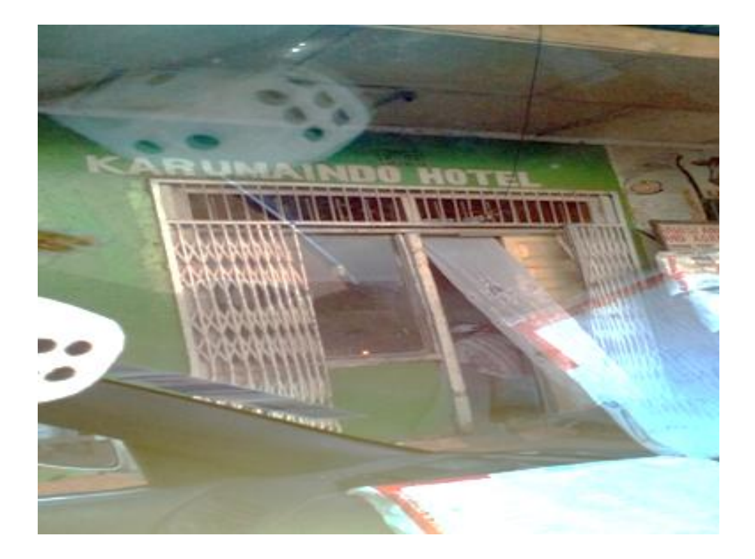
Figure 4, picture of a Hotel named using diminutive, taken by researcher.

Kamatumbo Super Butchery ( Ka-matumbo small offals) Super Butchery