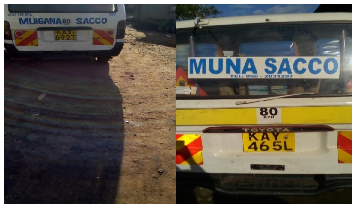
Figure 3: Pictures of service providers using acronyms to make service names which sound Kikuyu

In2004, Reh in his research on Business advertisement discussed on bilingualism in writing, and came up with four ways involving more than one language (bilingual/bilingual).