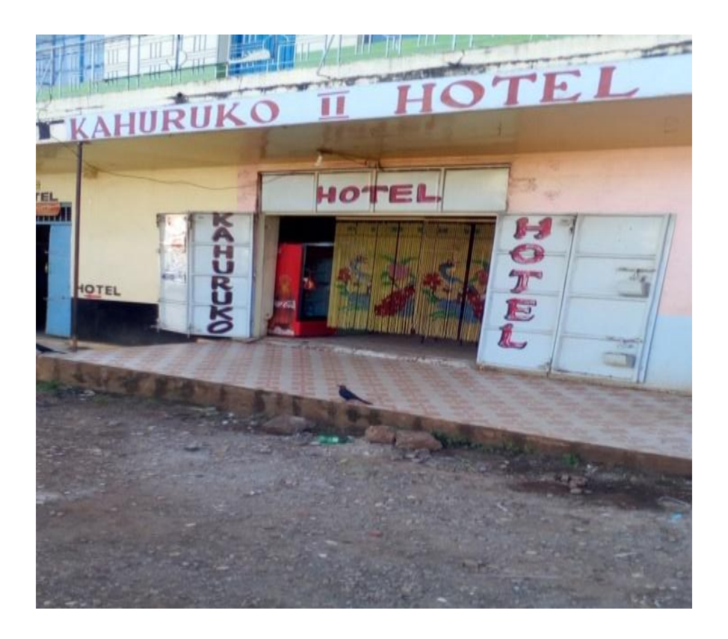
Figure 2: shows a hotel name using Kikuyu and English

This was the researcher's area of investigation involving the extent of bilingualism and the reason why these two languages are used. There are other towns in Murangá County but people mostly served by the business and service providers are mostly from the surrounding rural setting, Kikuyu speakers to be precise. A crosscheck from business names and services from Nairobi a cosmopolitan city creates a different picture from that used in naming of business and services in Murangá. It is curious to use different codes in business naming in an area where the language used in business is predominantly..