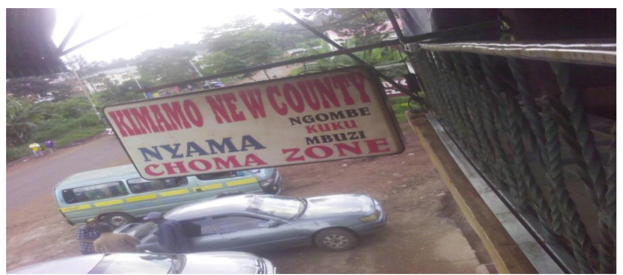
Figure 1; shows a restaurant's name composed of two languages namely English and Kiswahili.

Below is an example of an instance where owners use more than two languages ; KIMAMO (lair or den) NEW COUNTY Ng'ombe, kuku, Mbuzi, NYAMA CHOMA ZONE.