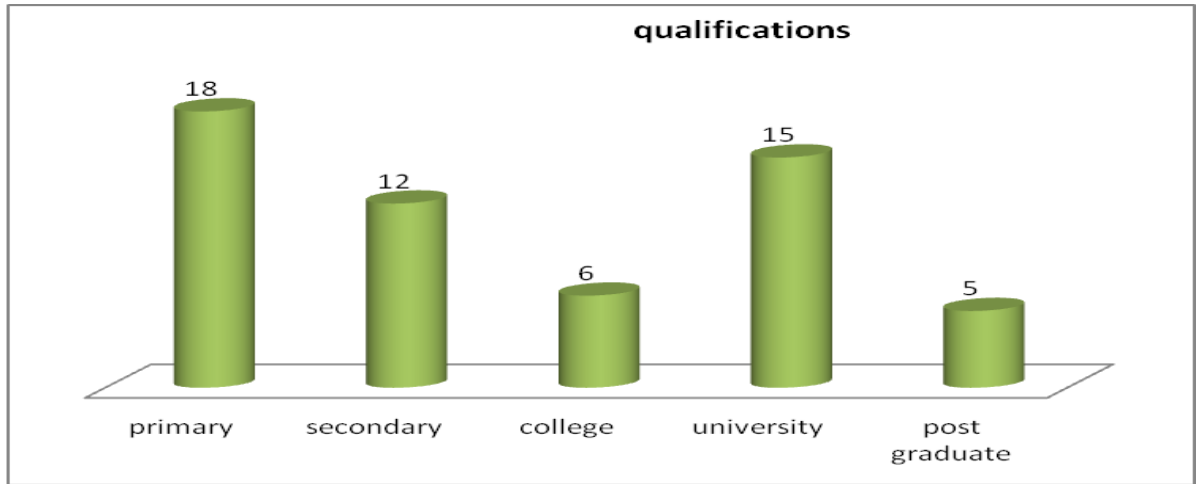
Figure 4. 1 Academic Qualification of the respondent (N= 56)

According to figure 4.1 18(32%) were primary school dropouts followed by 15(27%) university graduates. Net were secondary school leavers ate 12(21%). Those who were college graduates were 6(11%) post graduated were 5(10%) of the respondents. Although academic qualifications are more or less distributed across academic levels, the emphasis on primary school drop outs implies that low levels of academic qualifications are related to crime.