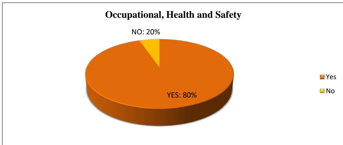
Figure 1: Occupational, Health and Safety