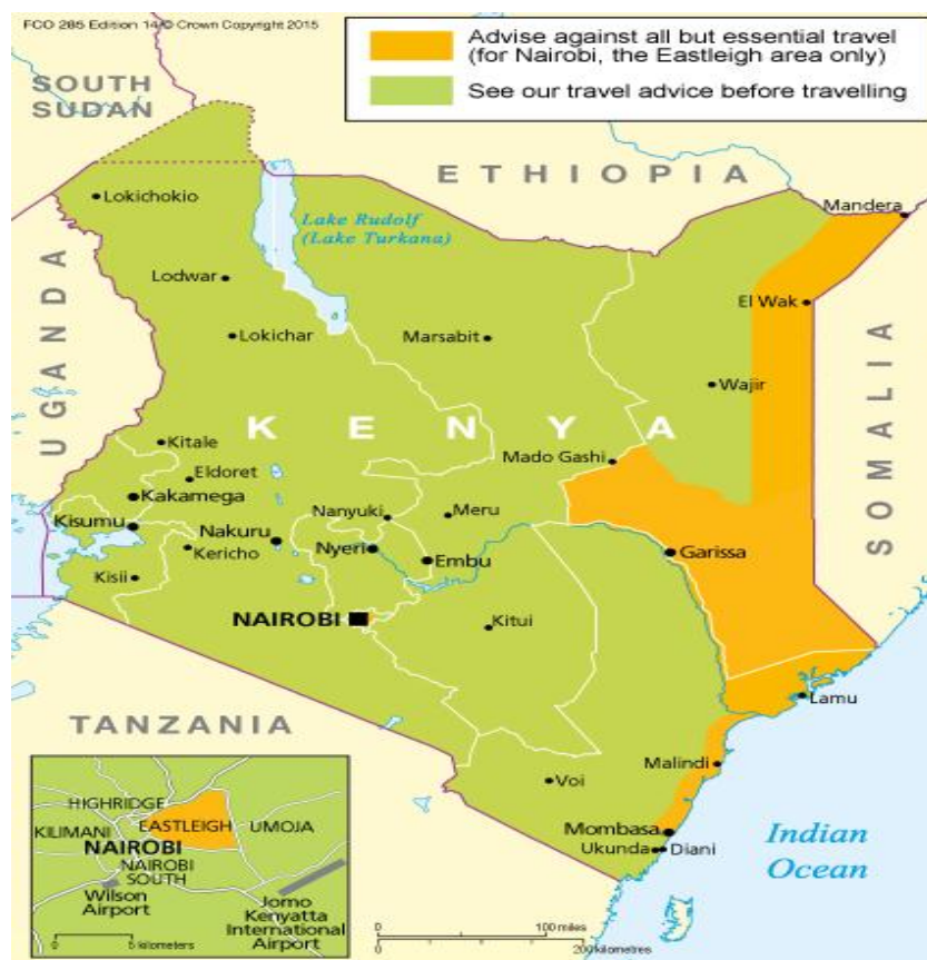
Figure 1.2 Kenya Terror Threat Areas

104