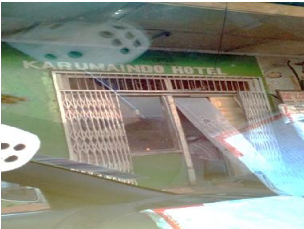
Figure 4, picture of a Hotel named using diminutive, taken by researcher.

Kamatumbo Super Butchery ( Ka-matumbo small offals) Super Butchery