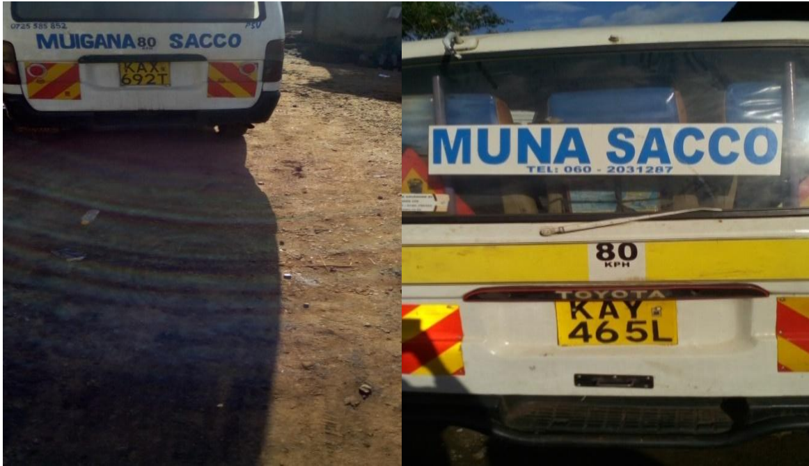
Figure 3: Pictures of service providers using acronyms to make service names which sound Kikuyu

In 2004, Reh in his research on Business advertisement discussed on bilingualism in writing, and came up with four ways involving more than one language (bilingual/bilingual).