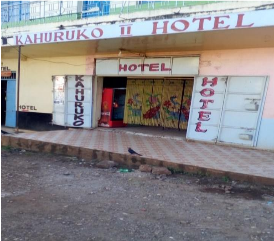
Figure 2: shows a hotel name using Kikuyu and English

This was the researcher's area of investigation involving the extent of bilingualism and the reason why these two languages are used. There are other towns in Murangá County but people mostly served by the business and service providers are mostly from the surrounding rural setting, Kikuyu speakers to be precise. A crosscheck from business names and services from Nairobi a cosmopolitan city creates a different picture from that used in naming of business and services in Murangá. It is curious to use different codes in business naming in an area where the language used in business is predominantly..