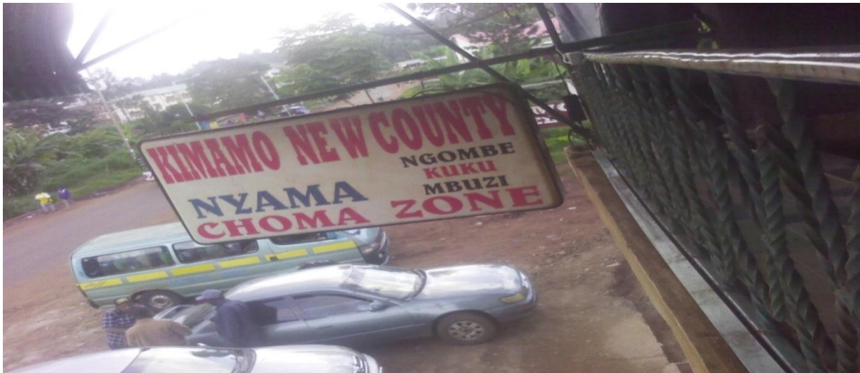
Figure 1; shows a restaurant’s name composed of two languages namely English and Kiswahili.

Below is an example of an instance where owners use more than two languages ; KIMAMO (lair or den) NEW COUNTY Ng’ombe, kuku, Mbuzi, NYAMA CHOMA ZONE.