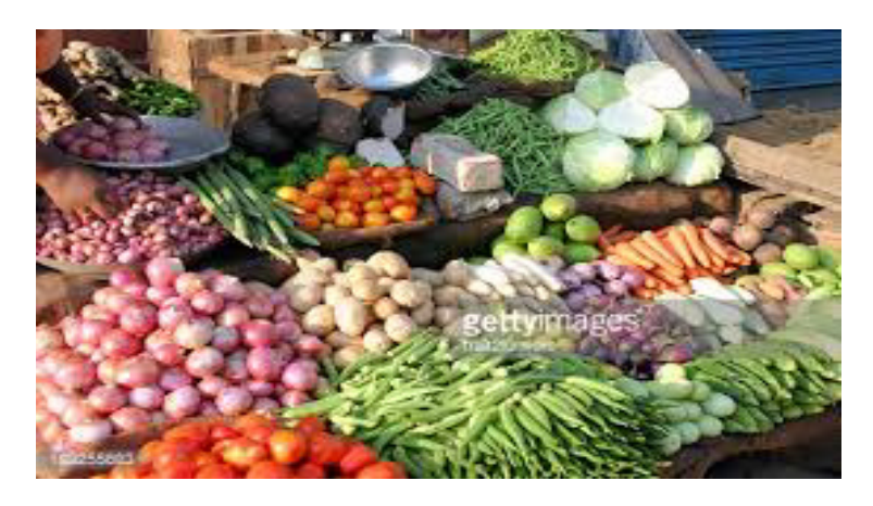
Plate 1. Assorted variety of Vegetables.

The vegetable samples analysed were obtained from different vegetable dealers in Makuyu Market in Kenya, during the dry season and wet seasons. They include; kales (sukumawiki) ( Brassica Oleracea C. ), cabbage ( Brassica Oleracea A. ) and tomatoes ( Lycopersicon Esculentum ). These are the most commonly consumed vegetables in the Kenyan markets today. The vegetables were then sorted out, weighed and then homogenized to make a representative sample. The samples were finally put in clean polythene bags, labeled and then stored safely in a refrigerator at -4^{\circ} C awaiting extraction and analysis. Plate 1, shows different types of vegetables consumed globally.